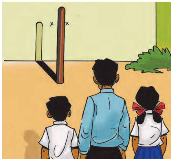
Figure 1.2 Experiment