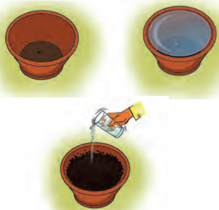
Figure 7.1 : Soil experiment