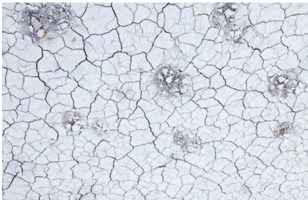
Figure 7.3 a : Soil degradation

Excessive irrigation draws the salts from the soil upwards and makes the soil saline and then unproductive. Due to excessive use of chemicals their residues remain in the soils for many years. They become a threat to the existence of microorganisms in the soils. It leads to lowering of the humus content in the soil and the plants do not get micronutrients. If the pH of the soil thus gets disturbed it is a sign of soil degradation.