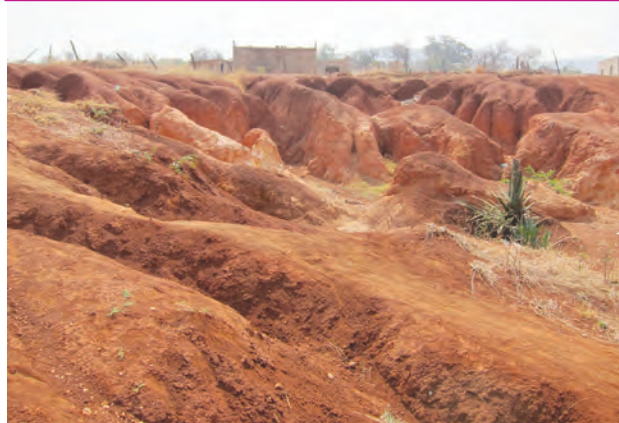
Figure 7.3 b : Soil erosion

that area. Such crops are given the status of Geographic Indication (GI). For example, Haapus mango of Sindhudurg, custard apple from Beed district, the oranges of Nagpur, etc.