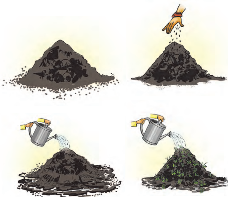
Figure 7.3 : Soil heap experiment

(Note for Teachers : Start this activity 10 days before teaching this lesson so that the saplings grow a little.)