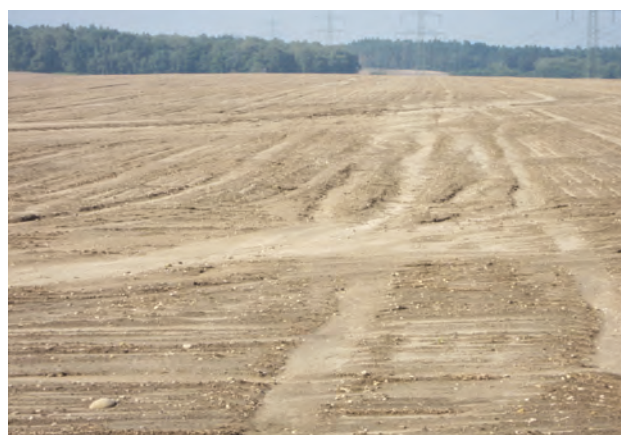
Figure 7.3 c : Soil erosion