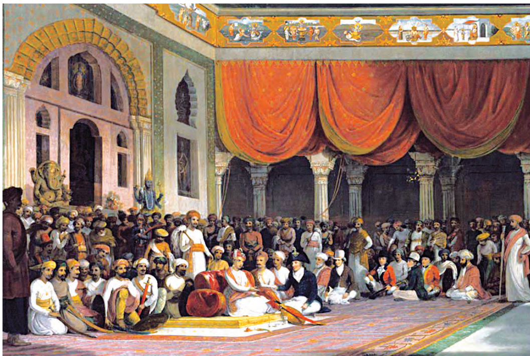
The Court of Sawai Madhavrao Peshwa