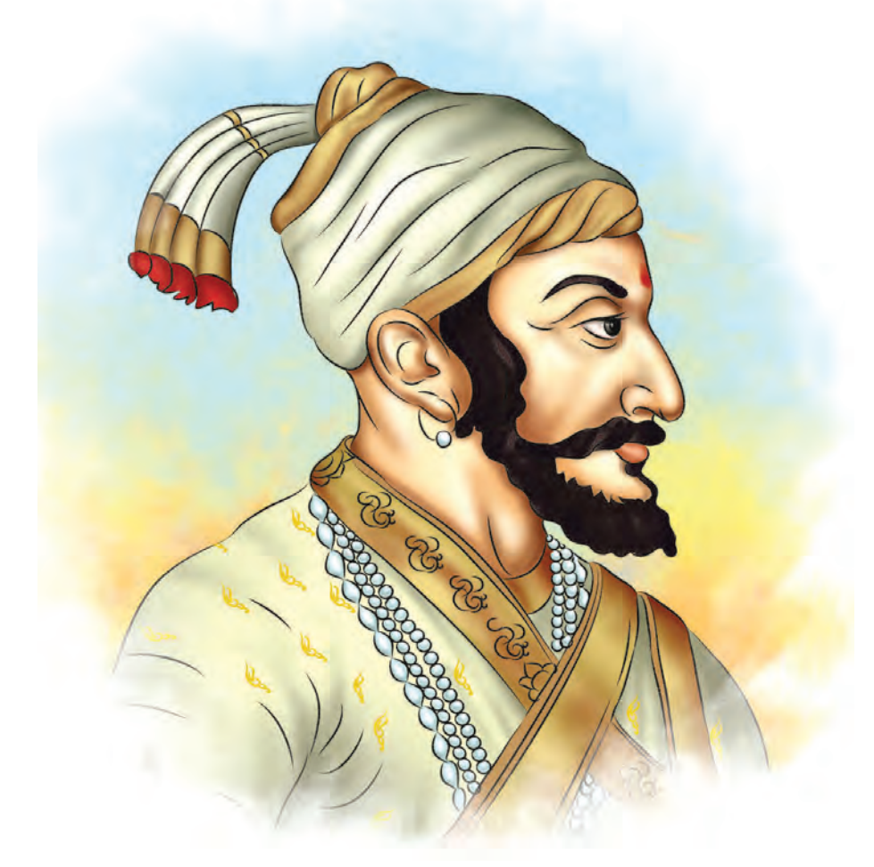
Chhatrapati Shivaji Maharaj

Maharaj ascended the throne of Swaraj . He now became the Chhatrapati of the Swaraj . As a symbol of sovereignty, the Rajyabhisheka shaka (the coronation era) was started. Maharaj became the founder of a new era. On the occasion of the coronation, special coins were minted – a gold coin called Hon and a copper coin called Shivrai with the legend 'Shri Raja Shivachhatrapati' inscribed on them. Thereafter, all royal correspondence