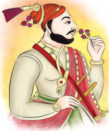
Chhatrapati Sambhaji Maharaj

Sambhajiraje speaking... Present a role play.