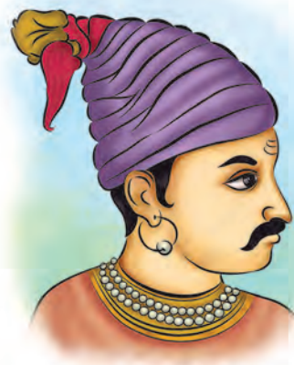
Chhatrapati Rajaram Maharaj

Chhatrapati Shivaji Maharaj. He was born on 24 February 1670 on Raigad. He became Chhatrapati after the death of Sambhaji Maharaj. Now Aurangzeb thought that his