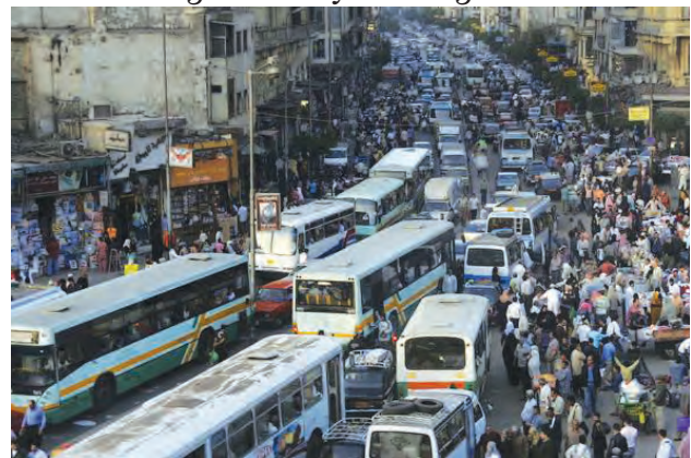
Figure 10.3 : Traffic jams

Traffic jams : As cities grow, people start living in the outskirts and suburbs of the city. People commute from the suburbs to the centre of the city for businesses and industries, trade, jobs, education, etc. Public transportation system is not sufficient and hence the number of private vehicles increases. This leads to an increase in traffic jams and travelling time increases significantly. See fig 10.3.