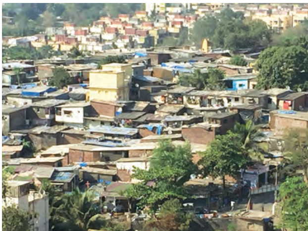
Figure 10.2 : Emergence of slums

Slums : Because of urbanisation, the population in cities increases rapidly. But the housing facilities do not increase in the same proportion as the population. Most of the migrated people are economically weak. They cannot afford the housing offered in the cities. Migrated people have generally come