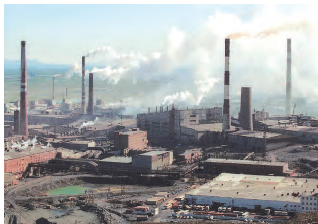
Figure 10.1 : Industrialisation

The development and concentration of industries in a region is a factor contributing towards urbanisation. Increase in industries leads to increase in the hopes of people who are attracted towards these industries from surrounding areas. This increases the speed of urbanisation. In the 19th century, Mumbai grew rapidly because textile mills started on a large scale in Mumbai. Many villages, which were originally fishing villages ( koliwad ), became part of Mumbai metropolitan area because of industrialisation and urbanisation.