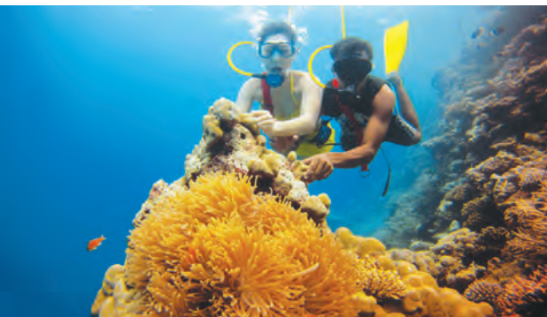
Life below the sea