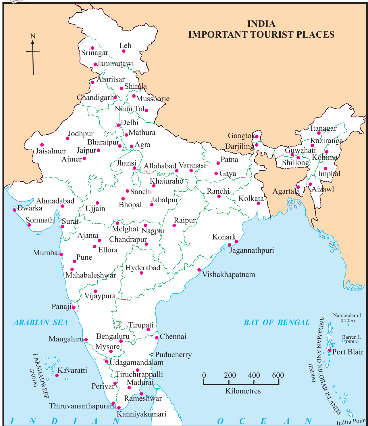
Figure 12.1 : Major tourist places of India