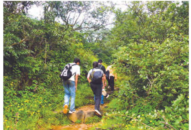
Wandering in the wild