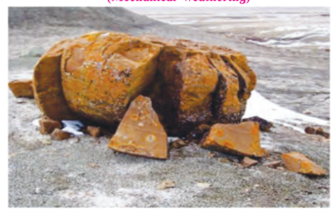
Figure 3.1 (C) : Shattering (Mechanical weathering)