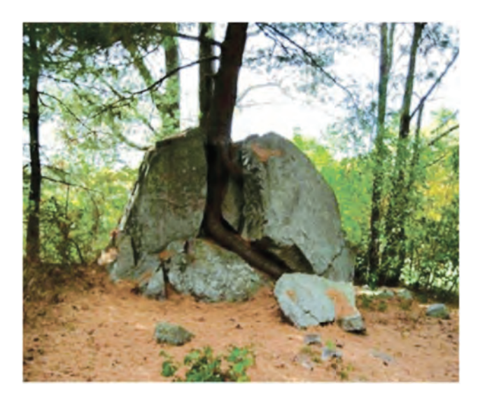
Figure 3.1 (F) : Biological weathering