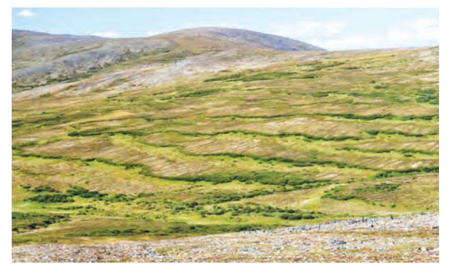
Figure 3.13 : Solifluction

Like weathering and mass movements, erosion is also an external process. Erosion occurs through various agents. Wind, running water, glaciers, sea water and groundwater cause erosion.