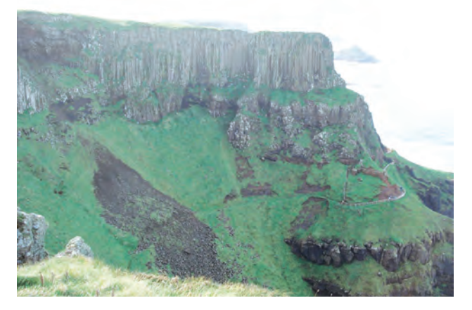
Figure 3.12 : Landslides