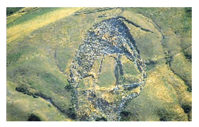
Figure 3.10 : Slumping

Rockfalls, landslides, land subsidence occur rapidly. Their effects are very destructive. The probability of these events is more in the regions having humid climates and steeper slopes. A thick layer of weathered material forms on the slope. When it rains in such areas, the rainwater penetrates the weathered materials and their weight increases. The weathered materials move very rapidly and come down the slope e.g., the mudslide at Malin Village of Pune district. Sometimes the weathered materials do not move downward but sink 'in situ' (where they are). This is called slumping. See fig 3.10. Such rapid mass movements may also occur because of earthquakes.