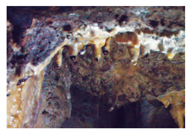
Figure 3.7 : Stalactite in Wadgaon Darya, Ahmadnagar

Some minerals in the rock get dissolved in water. Limestone is formed due to chemical precipitation between water and alkalis. At Wadgaon Darya in Ahmadnagar district, limestone gets chemically precipitated i.e. undergoes chemical weathering again. Similarly, because of solution, alkalis in the rock dissolve and make them brittle.