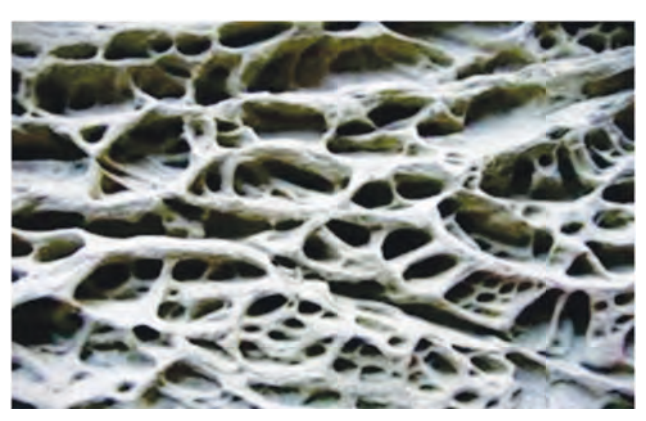
Figure 3.1 (H) : Chemical weathering /Salt weathering Geographical explanation

Breaking weakening of rocks or is a natural phenomenon. It is called weathering. Weathering can be of three types: mechanical (physical), chemical and biological. In arid climates, mechanical weathering is dominant while in humid climates. chemical weathering is more effective. Biological weathering occurs because of living organisms.