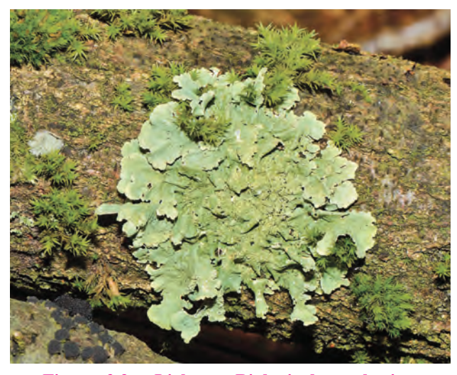
Figure 3.9 : Lichen - Biological weathering

Ants make large anthills. Rats, mice, rabbits and other worms and insects make burrows in the ground. These animals are called burrowing animals. Because of their activity, weathering of rock occurs. Besides these, algae, moss, lichen, other flora etc. grow in the rocks. They also help in weathering. See fig. 3.9.