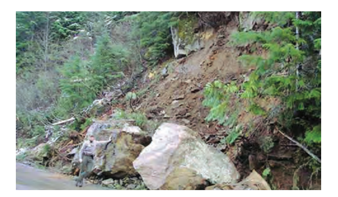
Figure 3.11 : Rockfall

the slopes, small layers of soil accumulate because of the movement of soil. This is called solifluction. See fig. 3.13