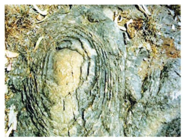
Figure 3.2 : Exfoliation Mechanical weathering mainly occurs because of the following reasons:

You will notice that just as we can remove each and every outer layer of the onion, similarly, in nature rocks undergo such a process. The exposed part of the rock heats more while the inner part is comparatively cooler. As a result, the outer layers of the rocks fall apart from the main rock. This is called exfoliation of the rock. See fig 3.2