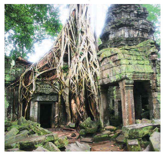
Figure 3.8 : Biological weathering

because of the roots of the trees. As the roots grow bigger, they create tension in the rocks and start breaking them. See fig. 3.8.