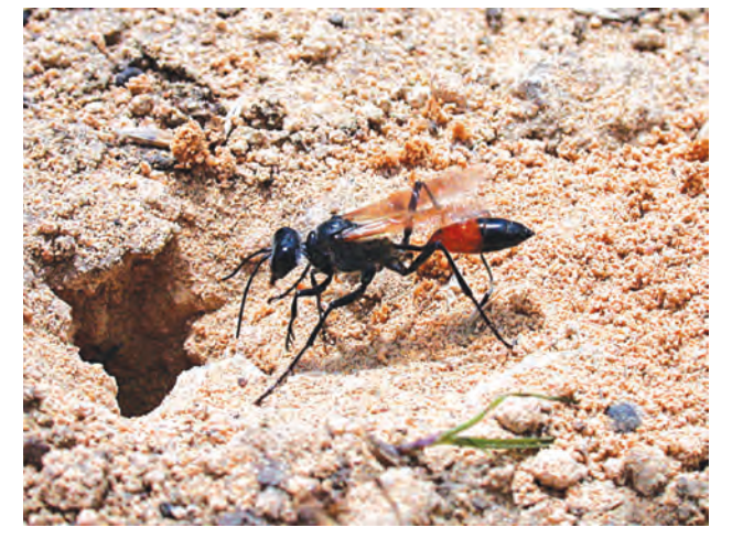
Figure 3.1 (E) : Biological weathering

Figure 3.1 (D) : Oxidation (Chemical weathering)