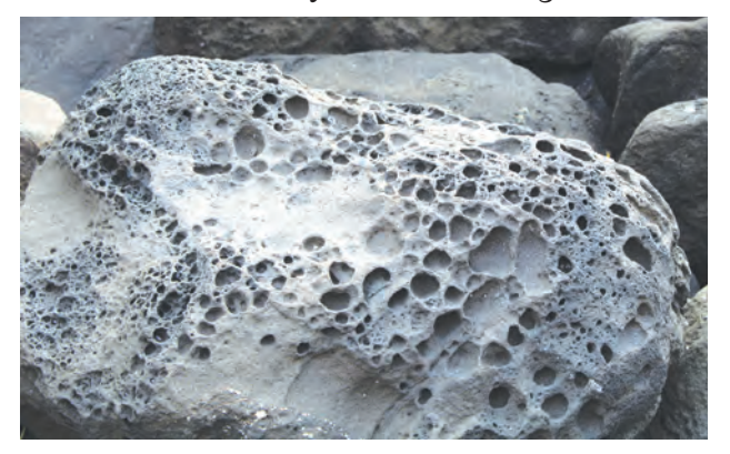
Figure 3.3 : Alkaline crystallization

Crystal growth: In rocky coasts, waves hit the sea cliff. The water is alkaline. Some water droplets hit the cracks in the rocks. In this alkaline water, the soluble materials in the rock get dissolved. This leads to formation of small holes in the rocks. This is the effect of solution. Alkaline water gets stored in these holes. Because of heat, this water turns into water vapor and only crystals of alkaline materials remain in the rocks. Crystals occupy more space. This causes tension in the rock. Holes are formed in the rocks. It looks like a honeycomb. See fig. 3.3