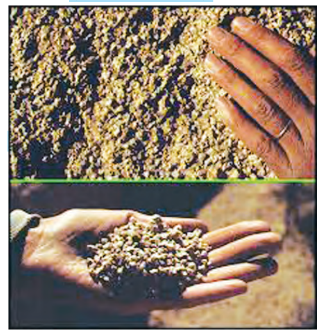
Figure 3.4 : Granular weathering

on the agglomeration of sand particles. Mud also makes sand particles come together. When water penetrates such rocks, the particles get loose and separate from the main rock. This is called granular weathering. See fig 3.4.