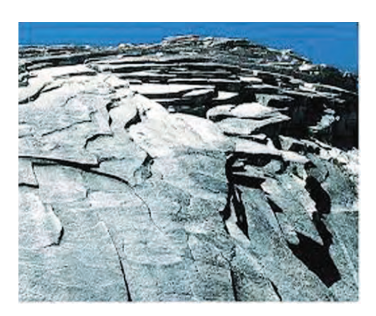
Figure 3.1 (A) : Exfoliation of dome-shaped hill (Mechanical weathering)

Because of the external processes like weathering, erosion, transportation and deposition, the primary and secondary landforms give way to the tertiary landforms. For example, valleys, sand dunes, delta, U-shaped valleys, etc.