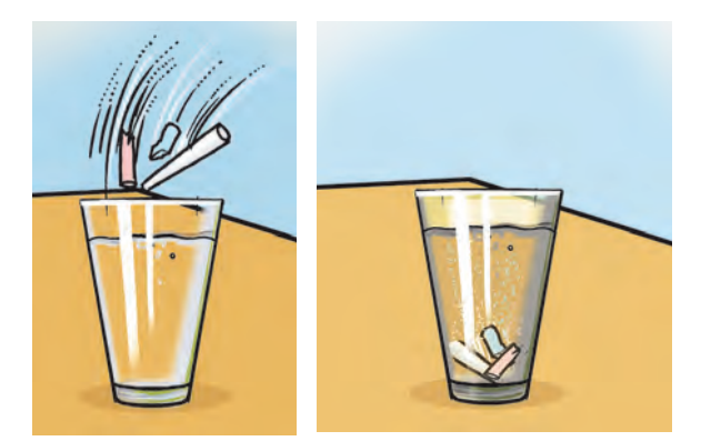
Figure 3.5 : Experiment of chalk

1) Take a glass of water and put a piece of chalk in it. On the next day,