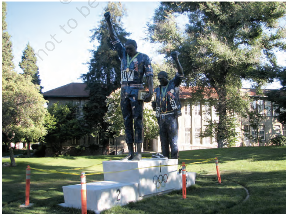
In 2005, the San Jose State University installed a 20-foot high sculpture representing the protest by Tommie Smith and John Carlos. A photograph of the original medal ceremony in 1968 is on the top.

Do you think that Carlos and Smith should have raised an internal matter of American society in an international forum? Would you say that what they did was political? Why do you think Peter Norman, who was neither Black nor American, joined in the gesture of protest? If you were in Norman's place what would you do?