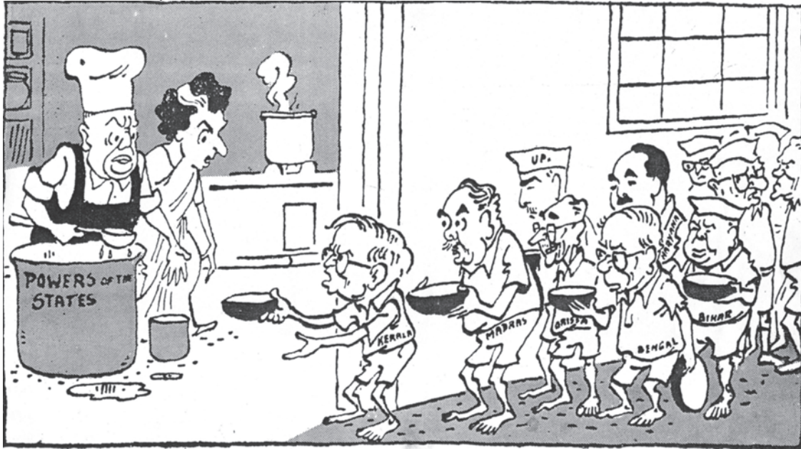
© Kuttty - Laughing with Kuttty