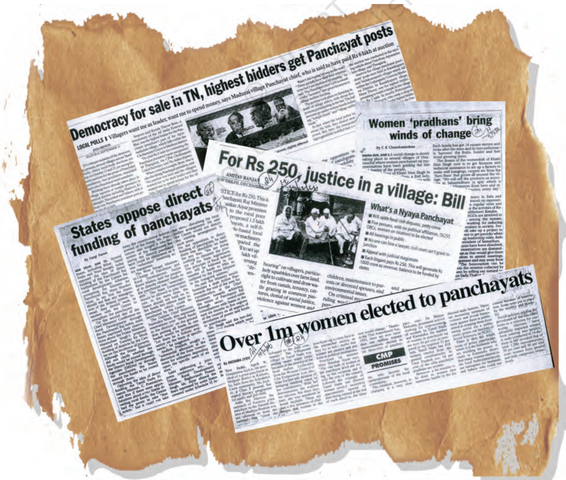
What do these newspaper clippings have to say about efforts of decentralisation in India?

Prime Minister runs the country. Chief Minister runs the state. Logically, then, the chairperson of Zilla Parishad should run the district. Why does the D.M. or Collector administer the district?