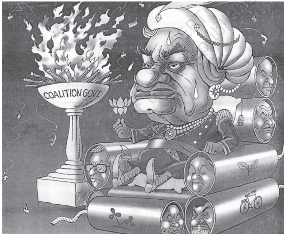
© Ajith Niman - India Today Book of Cartoons

Here are two cartoons showing the relationship between Centre and States. Should the State go to the Centre with a begging bowl? How can the leader of a coalition keep the partners of government satisfied?