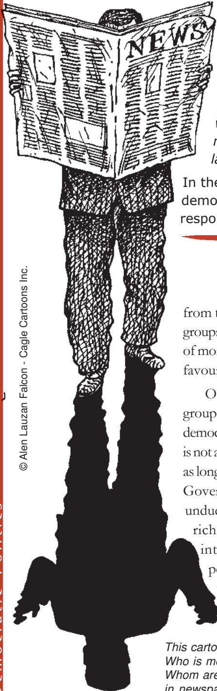
© Alen Lauzan Falcon - Cagle Cartoons Inc.

In the above passage what relationship do you see between democracy and social movements? How should this movement respond to the government?