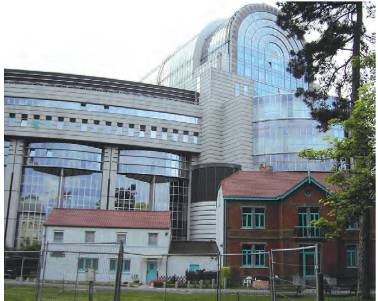
European Parliament in Brussels, Belgium

You might find the Belgian model very complicated. It indeed is very complicated, even for people living in Belgium. But these arrangements have worked well so far. They helped to avoid civic strife between the two major communities and a possible division of the country on linguistic lines. When many countries of Europe came together to form the European