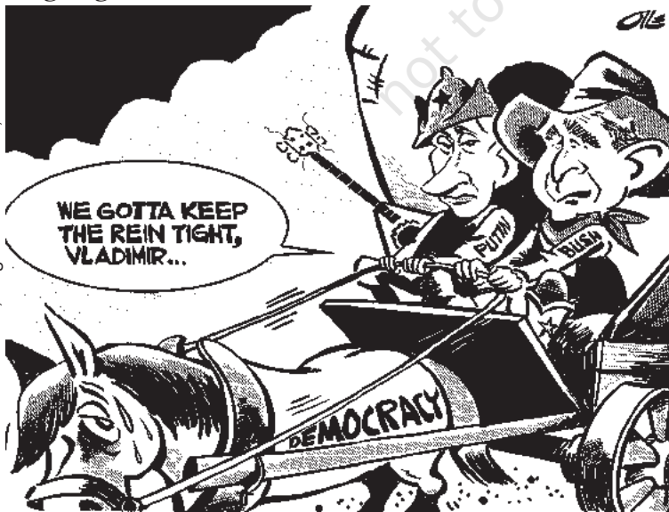
Reigning the Reins