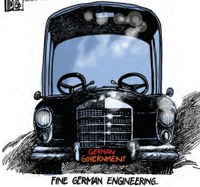
© Tab - The Calgary Sun, Cagle Cartoons Inc.

The cartoon at the left refers to the problems of running the Germany's grand coalition government that includes the two major parties of the country, namely the Christian Democratic Union and the Social Democratic Party. The two parties are historically rivals to each other. They had to form a coalition government because neither of them got clear majority of seats on their own in the 2005 elections. They take divergent positions on several policy matters, but still jointly run the government.