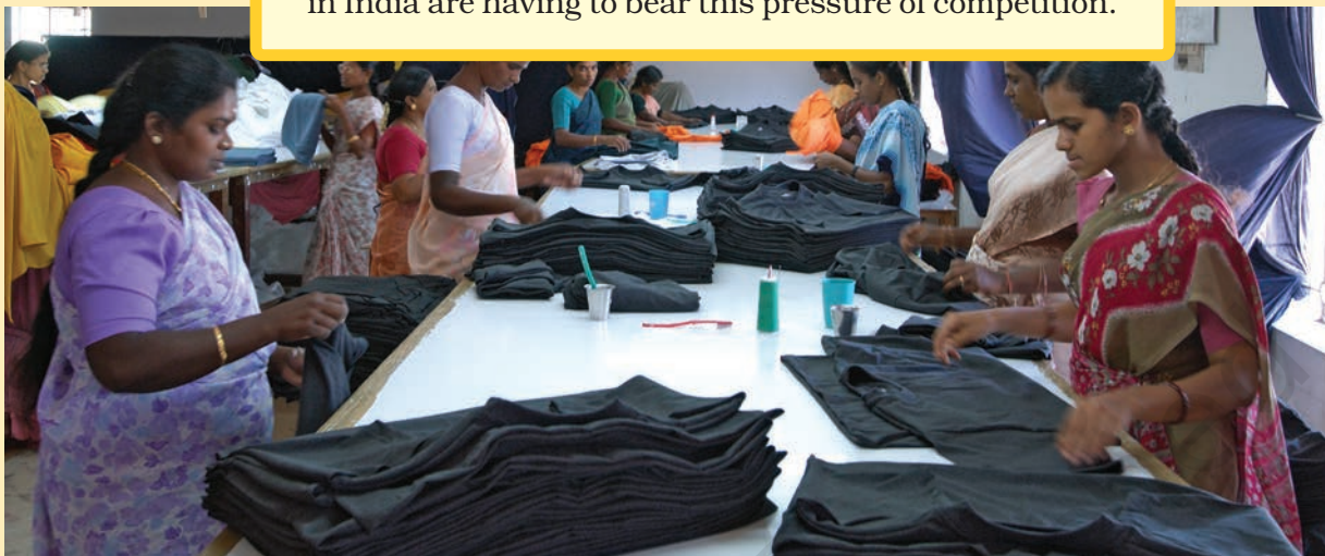
Factory workers folding garments for export. Though globalisation has created opportunities for paid work for women, the condition of employment shows that women are denied their fair share of benefits.

Let us see how the workers in the garment export industry in India are having to bear this pressure of competition.