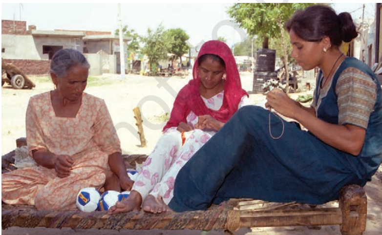
Women at home in Ludhiana making footballs for large MNCs

Thus, we see that there are a variety of ways in which the MNCs are spreading their production and interacting with local producers in various countries across the globe. By setting up partnerships with local companies, by using the local companies for supplies, by closely competing with the local companies or buying them up, MNCs are exerting a strong influence on production at these distant locations. As a result, production in these widely dispersed locations is getting interlinked.