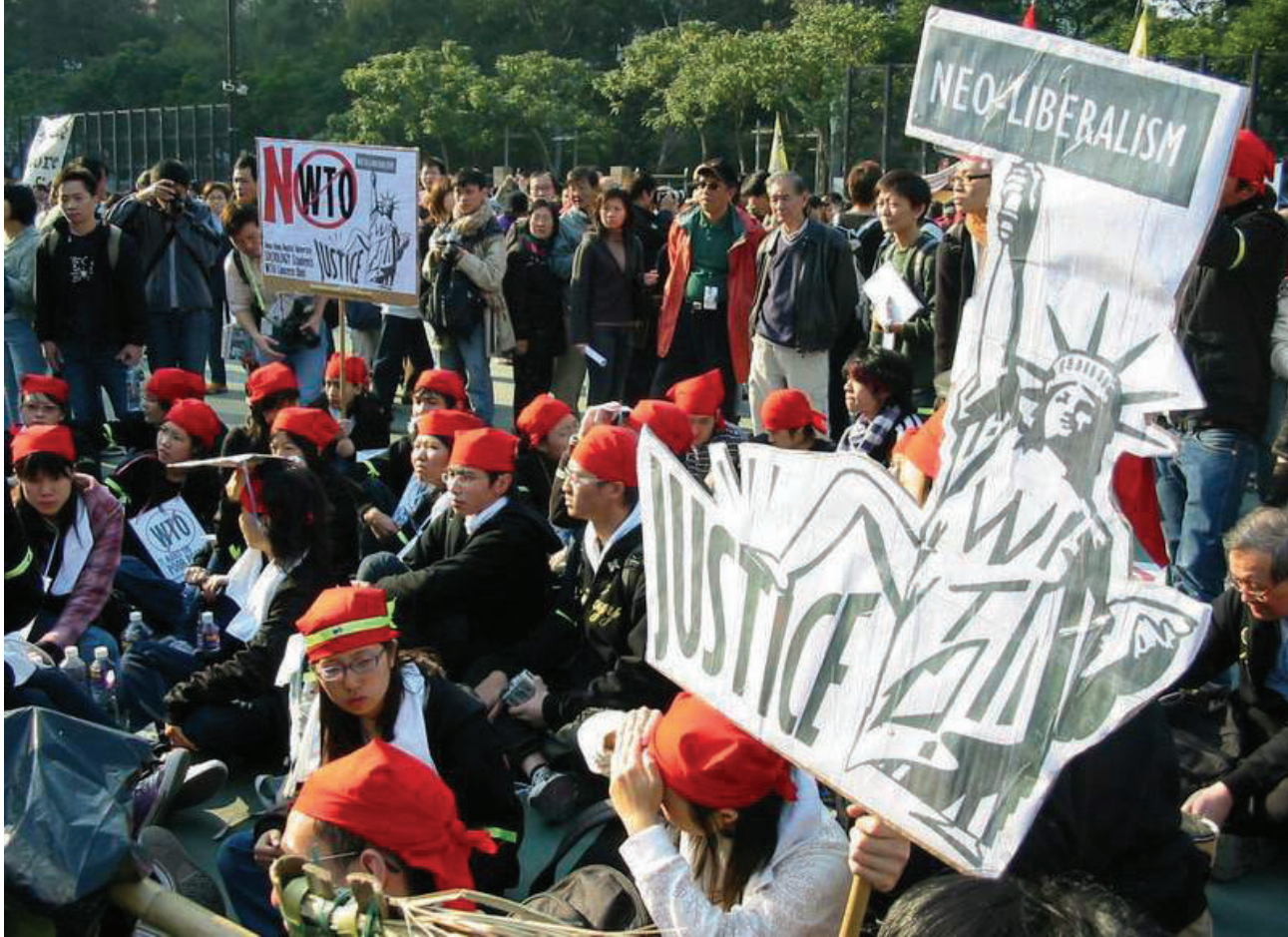
A demonstration against WTO in Hong Kong, 2005