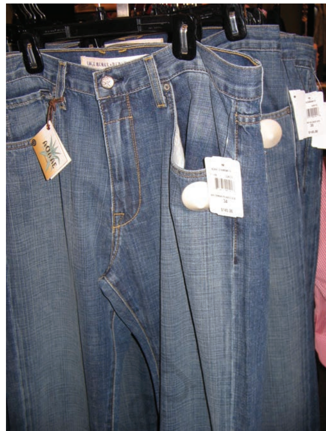
Jeans produced in developing countries being sold in USA for Rs 6500 ($145)

There's another way in which MNCs control production. Large MNCs in developed countries place orders for production with small producers. Garments, footwear, sports items are examples of industries where production is carried out by a large number of small producers around the world.