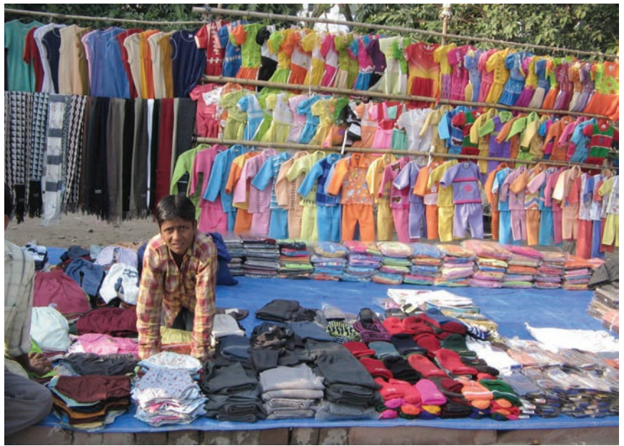
Small traders of readymade garments facing stiff competition from both the MNC brands and imports.

In general, with the opening of trade, goods travel from one market to another. Choice of goods in the markets rises. Prices of similar goods in the two markets tend to become equal. And, producers in the two countries now closely compete against each other even though they are separated by thousands of miles! Foreign trade thus results in connecting the markets or integration of markets in different countries.