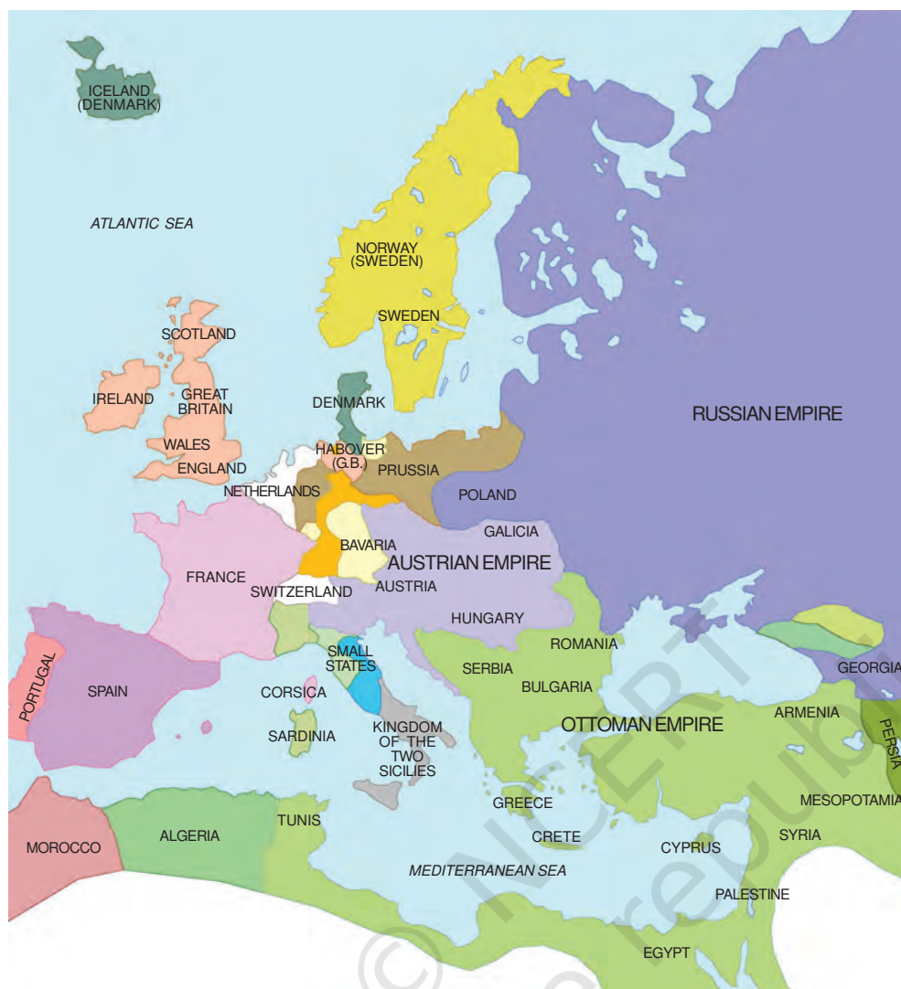
Fig. 3 — Europe after the Congress of Vienna, 1815.

Within the wide swathe of territory that came under his control, Napoleon set about introducing many of the reforms that he had already introduced in France. Through a return to monarchy Napoleon had, no doubt, destroyed democracy in France, but in the administrative field he had incorporated revolutionary principles in order to make the whole system more rational and efficient. The Civil Code of 1804 – usually known as the Napoleonic Code – did away with all privileges based on birth, established equality before the law and secured the right to property. This Code was exported to the regions under French control. In the Dutch Republic, in Switzerland, in Italy and Germany, Napoleon simplified administrative divisions, abolished the feudal system and freed peasants from serfdom and manorial dues. In the towns too, guild restrictions were removed. Transport and communication systems were improved. Peasants, artisans, workers and new businessmen