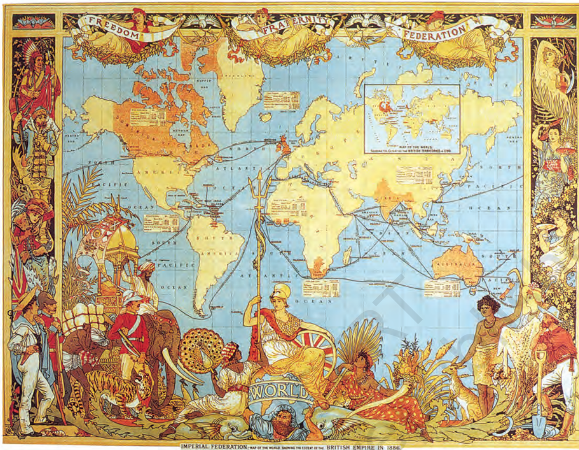
Fig. 20 — A map celebrating the British Empire.

At the top, angels are shown carrying the banner of freedom. In the foreground, Britannia — the symbol of the British nation — is triumphantly sitting over the globe. The colonies are represented through images of tigers, elephants, forests and primitive people. The domination of the world is shown as the basis of Britain's national pride.