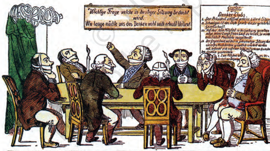
Fig. 6 — The Club of Thinkers, anonymous caricature dating to c. 1820.

What is the caricaturist trying to depict?