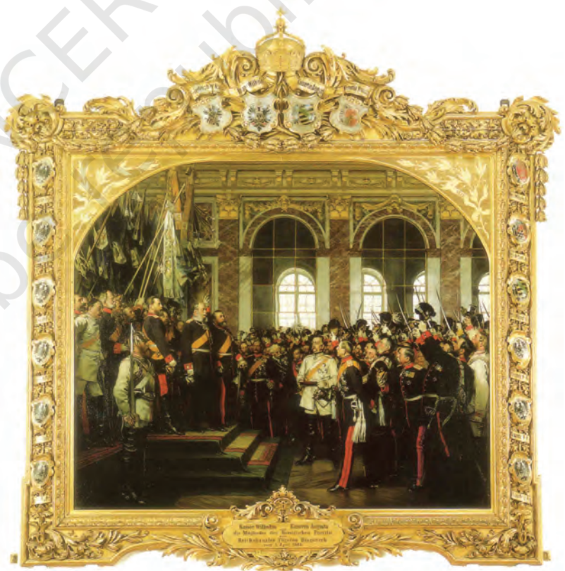
Fig. 11 – The proclamation of the German empire in the Hall of Mirrors at Versailles, Anton von Werner. At the centre stands the Kaiser and the chief commander of the Prussian army, General von Roon. Near them is Bismarck. This monumental work (2.7m x 2.7m) was completed and presented by the artist to Bismarck on the latter's 70th birthday in 1885.

The nation-building process in Germany had demonstrated the dominance of Prussian state power. The new state placed a strong emphasis on modernising the currency, banking, legal and judicial systems in Germany. Prussian measures and practices often became a model for the rest of Germany.