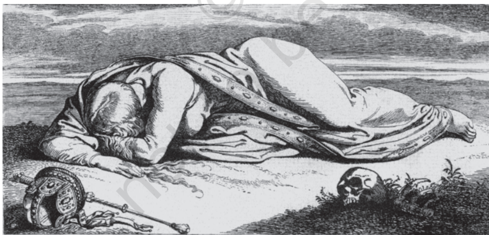
Fig. 18 — The fallen Germania , Julius Hübner, 1850.