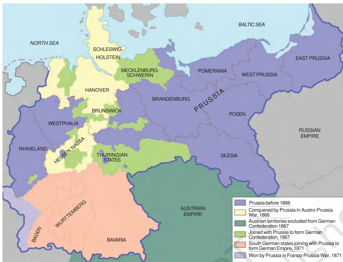
Fig. 12 – Unification of Germany (1866-71).