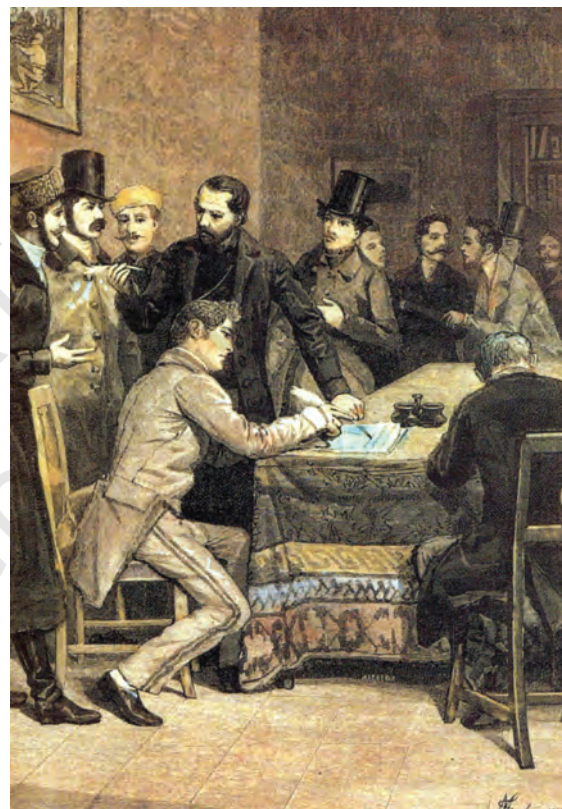
Fig. 7 — Giuseppe Mazzini and the founding of Young Europe in Berne 1833. Print by Giacomo Mantegazza.

One such individual was the Italian revolutionary Giuseppe Mazzini. Born in Genoa in 1807, he became a member of the secret society of the Carbonari. As a young man of 24, he was sent into exile in 1831 for attempting a revolution in Liguria. He subsequently founded two more underground societies, first, Young Italy in Marseilles, and then, Young Europe in Berne, whose members were like-minded young men from Poland, France, Italy and the German states. Mazzini believed that God had intended nations to be the natural units of mankind. So Italy could not continue to be a patchwork of small states and kingdoms. It had to be forged into a single unified republic within a wider alliance of nations. This unification alone could be the basis of Italian liberty. Following his model, secret societies were set up in Germany, France, Switzerland and Poland. Mazzini's relentless opposition to monarchy and his vision of democratic republics frightened the conservatives. Metternich described him as 'the most dangerous enemy of our social order'.