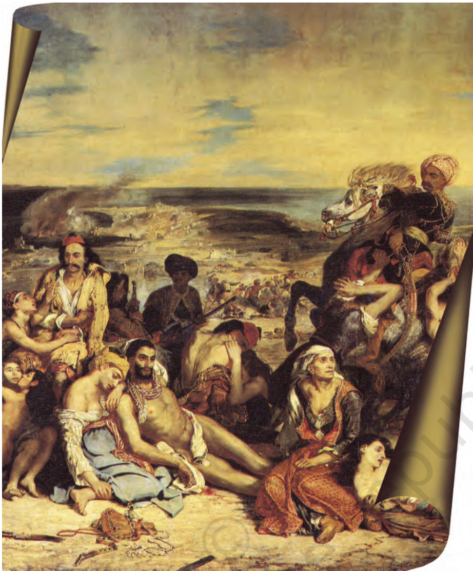
Fig. 8 — The Massacre at Chios, Eugene Delacroix, 1824.

The French painter Delacroix was one of the most important French Romantic painters. This huge painting (4.19m x 3.54m) depicts an incident in which 20,000 Greeks were said to have been killed by Turks on the island of Chios. By dramatising the incident, focusing on the suffering of women and children, and using vivid colours, Delacroix sought to appeal to the emotions of the spectators, and create sympathy for the Greeks.