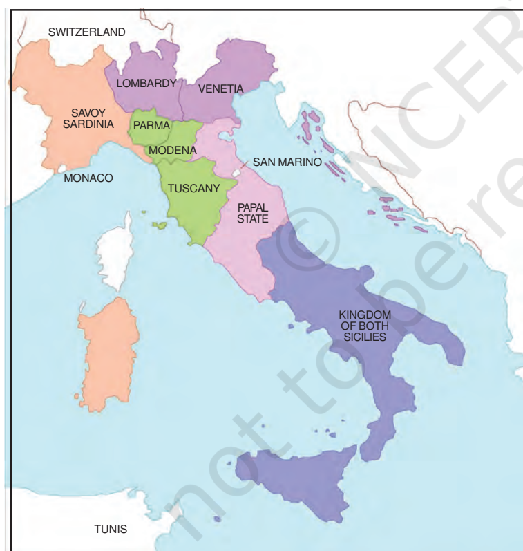
Fig. 14(a) — Italian states before unification, 1858.

Examine Fig. 14(b). Which was the first region to become a part of unified Italy? Which was the last region to join? In which year did the largest number of states join?