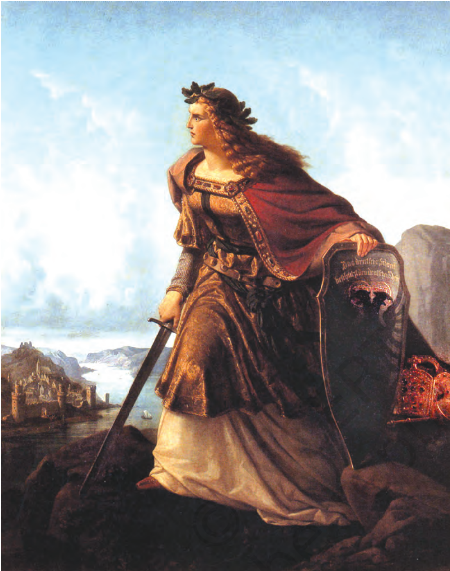
Fig. 19 — Germania guarding the Rhine.

In 1860, the artist Lorenz Clasen was commissioned to paint this image. The inscription on Germania's sword reads: 'The German sword protects the German Rhine.'