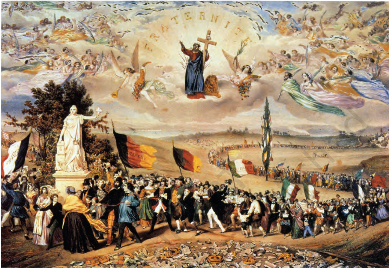
Fig. 1 — The Dream of Worldwide Democratic and Social Republics – The Pact Between Nations , a print prepared by Frédéric Sorrieu, 1848.

In 1848, Frédéric Sorrieu, a French artist, prepared a series of four prints visualising his dream of a world made up of ‘democratic and social Republics’, as he called them. The first print (Fig. 1) of the series, shows the peoples of Europe and America – men and women of all ages and social classes – marching in a long train, and offering homage to the statue of Liberty as they pass by it. As you would recall, artists of the time of the French Revolution personified Liberty as a female figure – here you can recognise the torch of Enlightenment she bears in one hand and the Charter of the Rights of Man in the other. On the earth in the foreground of the image lie the shattered remains of the symbols of absolutist institutions. In Sorrieu’s utopian vision, the peoples of the world are grouped as distinct nations, identified through their flags and national costume. Leading the procession, way past the statue of Liberty, are the United States and Switzerland, which by this time were already nation-states. France,