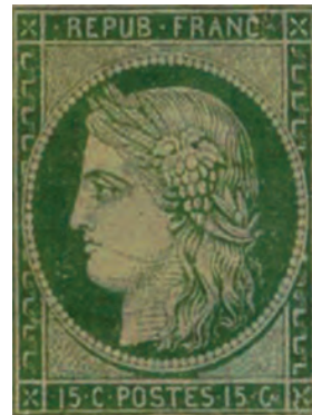
Fig. 16 — Postage stamps of 1850 with the figure of Marianne representing the Republic of France.

Allegory – When an abstract idea (for instance, greed, envy, freedom, liberty) is expressed through a person or a thing. An allegorical story has two meanings, one literal and one symbolic