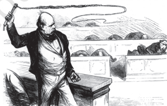
Fig. 13 – Caricature of Otto von Bismarck in the German reichstag (parliament), from Figaro, Vienna, 5 March 1870.

During the 1830s, Giuseppe Mazzini had sought to put together a coherent programme for a unitary Italian Republic. He had also formed a secret society called Young Italy for the dissemination of his goals. The failure of revolutionary uprisings both in 1831 and 1848 meant that the mantle now fell on Sardinia-Piedmont under its ruler King Victor Emmanuel II to unify the Italian states through war. In the eyes of the ruling elites of this region, a unified Italy offered them the possibility of economic development and political dominance.