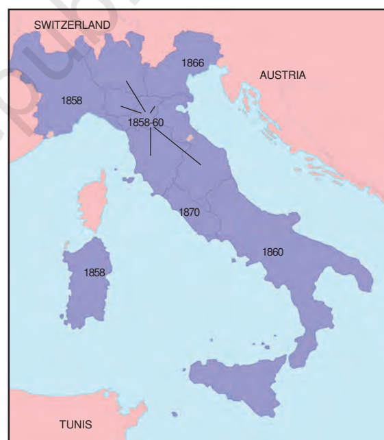
Fig. 14(b) — Italy after unification.

The map shows the year in which different regions (seen in Fig 14(a)) become part of a unified Italy.