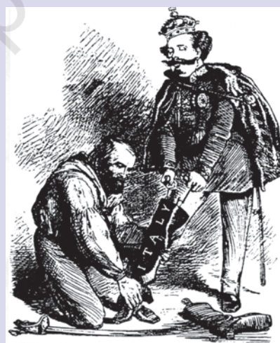
Fig. 15 – Garibaldi helping King Victor Emmanuel II of Sardinia-Piedmont to pull on the boot named ‘Italy’. English caricature of 1859.

In 1867, Garibaldi led an army of volunteers to Rome to fight the last obstacle to the unification of Italy, the Papal States where a French garrison was stationed. The Red Shirts proved to be no match for the combined French and Papal troops. It was only in 1870 when, during the war with Prussia, France withdrew its troops from Rome that the Papal States were finally joined to Italy.