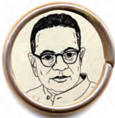
T.T. Krishnamachari (1899-1974) born: Tamil Nadu. Member, Drafting Committee. Entrepreneur and Congress leader. Later: Finance Minister in the Union Cabinet.