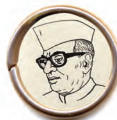
Kanhaiyalal Maniklal Munshi

Constituent Assembly at the stroke of midnight on 15 August 1947: