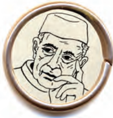
Jawaharlal Nehru (1889-1964) born: Uttar Pradesh. Prime Minister of the interim government. Lawyer and Congress leader. Advocate of socialism, democracy and anti-imperialism. Later: First Prime Minister of India.