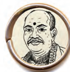
Shyama Prasad Mukherjee

(1891-1956) born: Madhya Pradesh. Chairman of the Drafting Committee. Social revolutionary thinker and agitator against caste divisions and caste based inequalities. Later: Law minister in the first cabinet of post-independence India. Founder of Republican Party of India.