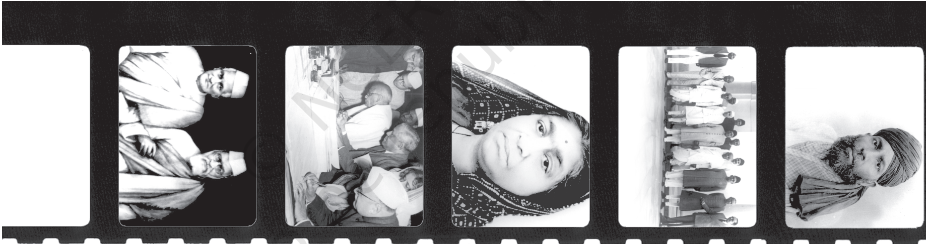
Nehru Memorial Museum and Library, New Delhi