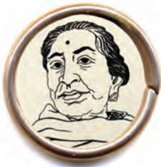
Sarojini Naidu (1879-1949) born: Andhra Pradesh. Poet, writer and political activist. Among the foremost women leaders in the Congress. Later: Governor of Uttar Pradesh.