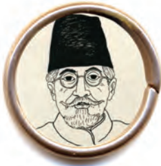
Abul Kalam Azad (1888-1958) born: Saudi Arabia. Educationist, author and theologian; scholar of Arabic. Congress leader, active in the national movement. Opposed Muslim separatist politics. Later: Education Minister in the first union cabinet.