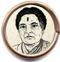
G. Durgabai Deshmukh (1909-1981)

born: Andhra Pradesh. Advocate and public activist for women's emancipation. Founder of Andhra Mahila Sabha. Congress leader. Later: Founder Chairperson of Central Social Welfare Board.