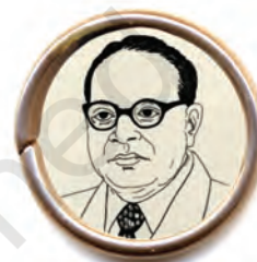
Bhimrao Ramji Ambedkar

(1887-1971) born:Gujarat. Advocate, historian and linguist. Congress leader and Gandhian. Later: Minister in the Union Cabinet. Founder of the Swatantra Party.