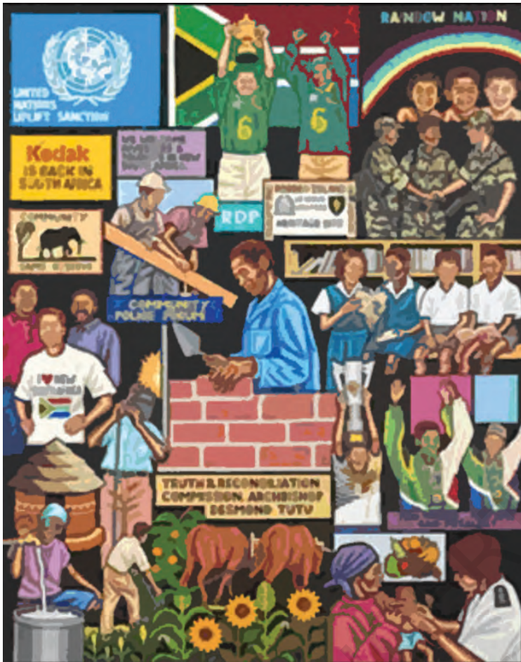
Wikipedia, GNU Free Documentation License

The South African constitution inspires democrats all over the world. A state denounced by the entire world till 1994 as the most undemocratic one is now seen as a model of democracy. What made this change possible was the determination of the people of South Africa to work together, to transform bitter experiences into the binding glue of a rainbow nation. Speaking on the South African Constitution, Mandela said: