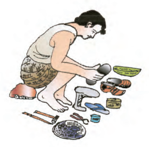
Picture 2.6 Can you remember how much did you pay when you asked him to mend your shoes or slippers?

seems forced upon them. They may therefore want other work of their choice. Poor people cannot afford to sit idle. They tend to engage in any activity irrespective of its earning potential. Their earning keeps them on a bare subsistence level.