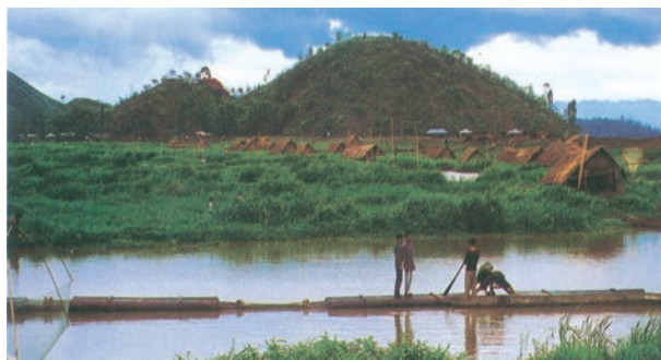
Figure 3.6 : Loktak Lake

Most of the freshwater lakes are in the Himalayan region. They are of glacial origin. In other words, they formed when glaciers dug out a basin, which was later filled with snowmelt. The Wular lake in Jammu and Kashmir, in contrast, is the result of tectonic activity. It is the largest freshwater lake in India. The Dal lake, Bhimtal, Nainital, Loktak and Barapani are some other important freshwater lakes.