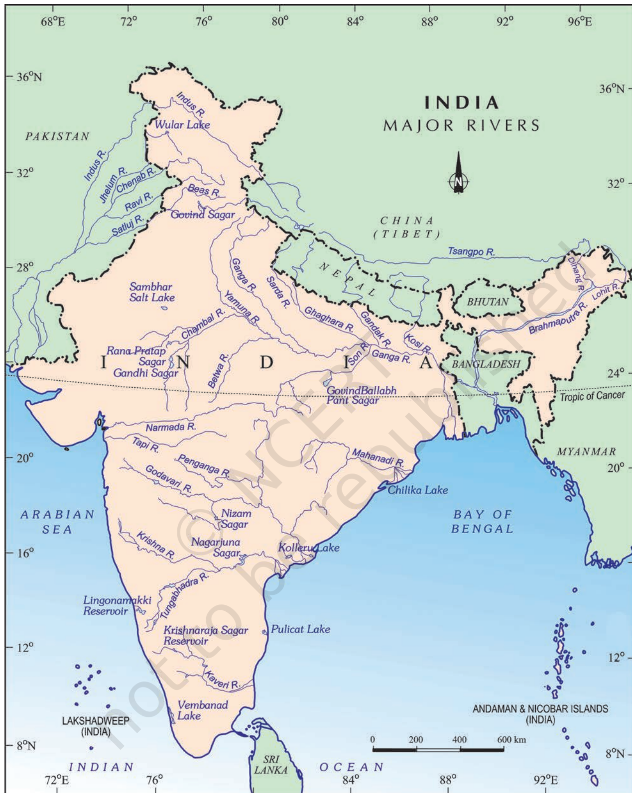
Figure 3.4 : Major Rivers and Lakes