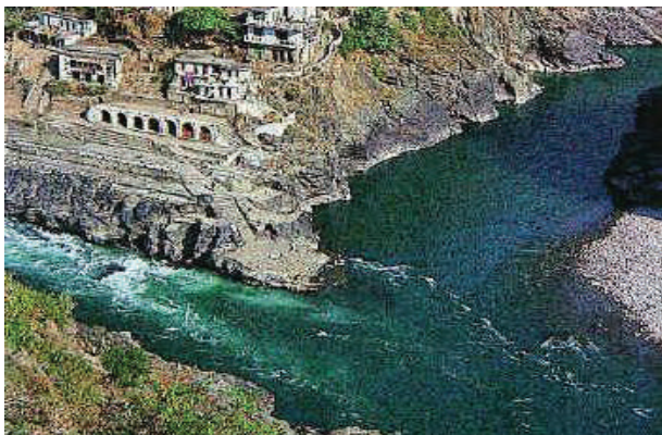
Figure 3.5 : Confluence of Bhagirathi and Alaknanda at Devprayag

The Ganga is joined by many tributaries from the Himalayas, a few of them being major rivers, such as the Yamuna, the Ghaghara, the Gandak and the Kosi. The river Yamuna rises from the Yamunotri Glacier in the Himalayas. It flows parallel to the Ganga and as a right bank tributary meets the Ganga at Allahabad. The Ghaghara, the Gandak and the Kosi rise in the Nepal Himalaya. They are the rivers, which flood parts of the northern plains every year, causing widespread damage to life and property, whereas, they enrich the soil for agricultural use.