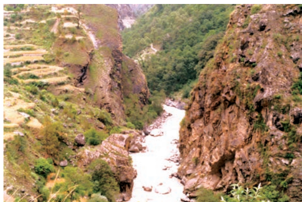
Figure 3.2 : A Gorge

Apart from originating from the two major physiographic regions of India, the Himalayan and the Peninsular rivers are different from each other in many ways. Most of the Himalayan rivers are perennial . It means that they have water throughout the year. These rivers receive water from rain as well as from melted snow from the lofty mountains. The two major Himalayan rivers, the Indus and the Brahmaputra originate from the north of the mountain ranges. They have cut through the mountains making gorges. The Himalayan rivers have long courses from their source to the sea.