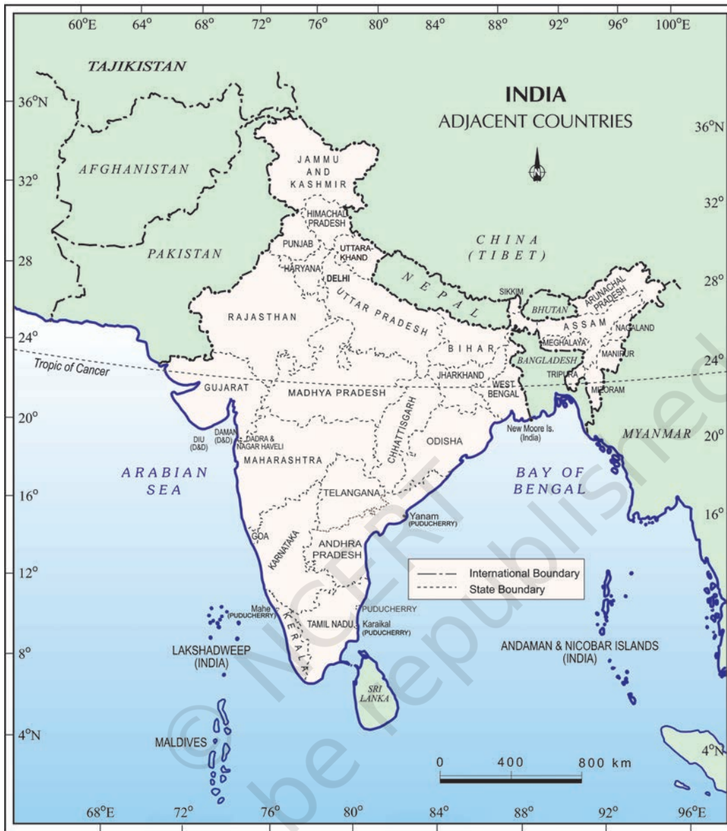
Figure 1.5 : India and Adjacent Countries

Sri Lanka and Maldives. Sri Lanka is separated from India by a narrow channel of sea formed by the Palk Strait and the Gulf of Mannar, while Maldives Islands are situated to the south of the Lakshadweep Islands.