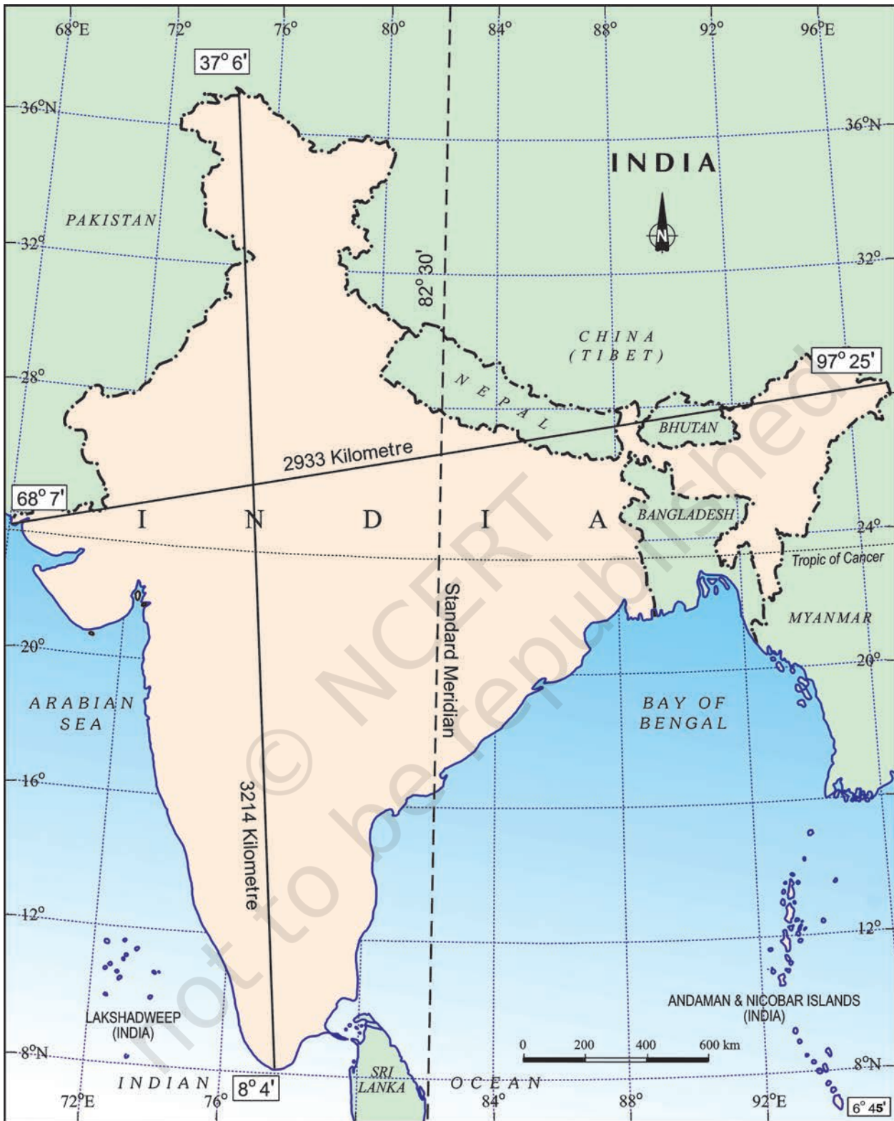
Figure 1.3 : India : Extent and Standard Meridian