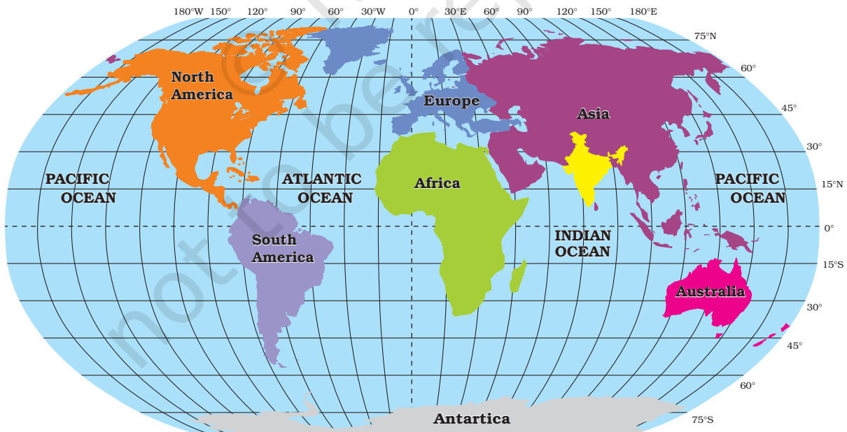
Figure 1.1 : India in the World

The land mass of India has an area of 3.28 million square km. India's total area accounts for about 2.4 per cent of the total geographical