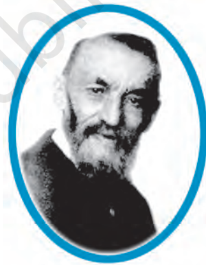
G. Peano (1858-1932)

In contrast to deduction, inductive reasoning depends on working with each case, and developing a conjecture by observing incidences till we have observed each and every case. It is frequently used in mathematics and is a key aspect of scientific reasoning, where collecting and analysing data is the norm. Thus, in simple language, we can say the word induction means the generalisation from particular cases or facts.