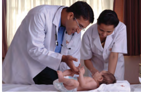
Most babies do not get basic healthcare

The problem does not end with Infant Mortality Rate. The last column of table 1.4 shows that about half of the children aged 14-15 in Bihar are not attending school beyond Class 8. This means that if you went to school in Bihar nearly half of your elementary class friends would be missing. Those who could have been in school are not there! If this had happened to you, you would not be able to read what you are reading now.