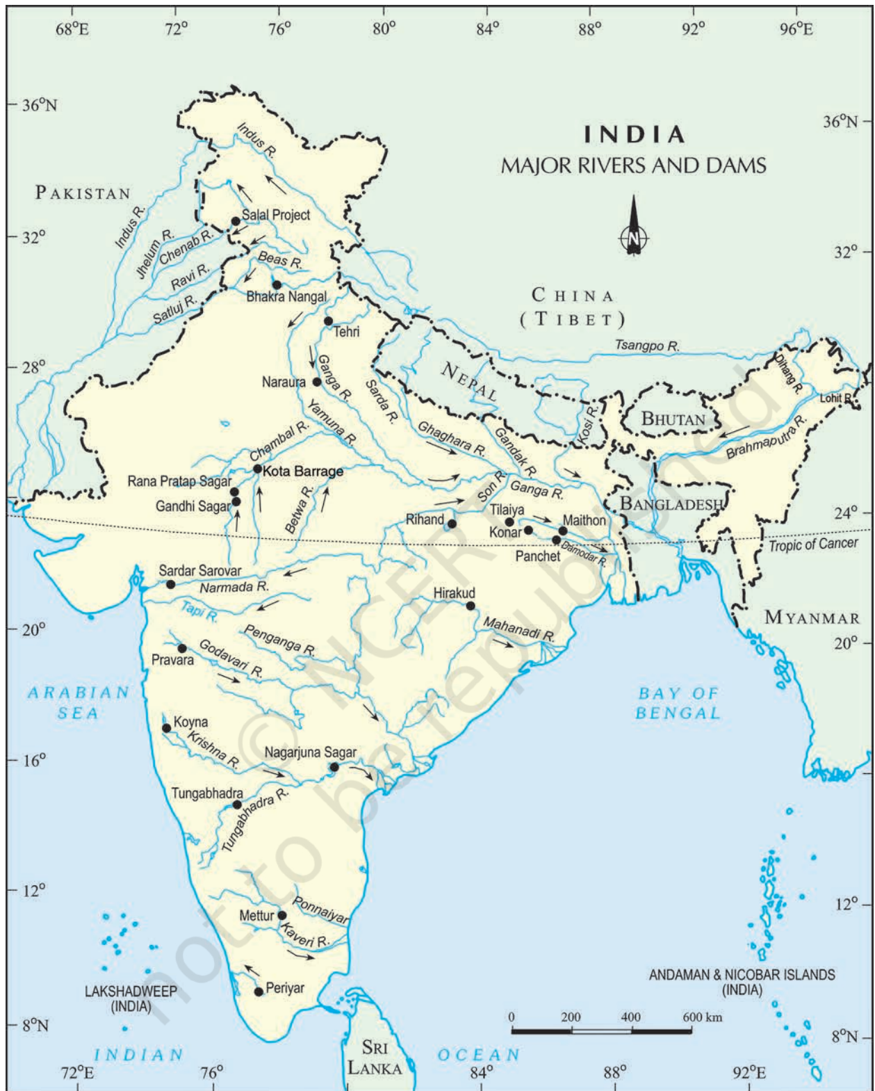
India: Major Rivers and Dams