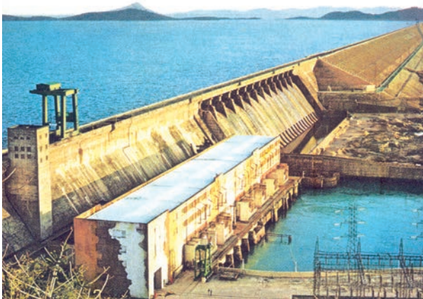
Fig. 3.2: Hirakud Dam

What are dams and how do they help us in conserving and managing water? Dams were traditionally built to impound rivers and rainwater that could be used later to irrigate agricultural fields. Today, dams are built not just for irrigation but for electricity generation, water supply for domestic and industrial uses, flood control, recreation, inland navigation and fish breeding. Hence, dams are now referred to as multi-purpose projects where the many uses of the impounded water are integrated with one another. For example, in the Sutluj-Beas river basin, the Bhakra – Nangal project water is being used both for hydel power production and irrigation. Similarly, the Hirakud project in the Mahanadi basin integrates conservation of water with flood control.