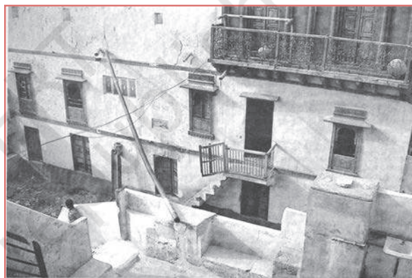
Rooftop harvesting was common across the towns and villages of the Thar. Rainwater that falls on the sloping roofs of houses is taken through a pipe into an underground tanka (circular holes in the ground), built in the main house or in the courtyard. The picture above shows water being taken from a neighbour's roof through a long pipe. Here the neighbour's rooftop has been used for collection of rainwater. The picture shows a hole through which rainwater flows down into an underground tanka .

Fortunately, in many parts of rural and urban India, rooftop rainwater harvesting is being successfully adapted to store and conserve water. In Gendathur, a remote backward village in Mysuru, Karnataka, villagers have installed, in their household's rooftop, rainwater harvesting system to meet their water needs. Nearly 200 households have installed this system and the village has earned the rare distinction of being rich in rainwater. See Fig. 3.6 for a better understanding of the rooftop rainwater harvesting system which is adapted here. Gendathur receives an annual precipitation of 1,000 mm, and with 80 per cent of collection efficiency and of about 10 fillings, every house can collect and use about 50,000 litres of water annually. From the 200 houses, the net amount of rainwater harvested annually amounts to 1,00,000 litres.