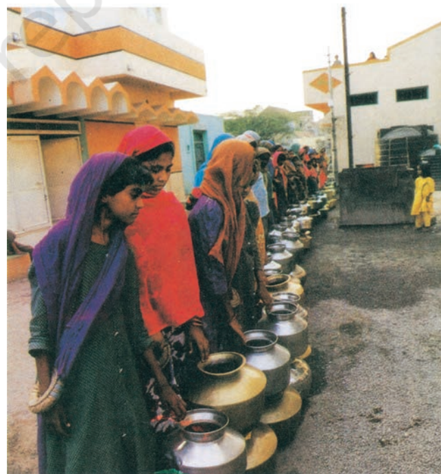
Fig. 3.1: Water Scarcity

एक ओर इजराइल जैसे 25 सेमी. औसत वार्षिक वर्षा वाले देश में जल का कोई अभाव नहीं है तो दूसरी ओर 114 सेमी. औसत वार्षिक वर्षा वाले हमारे देश में प्रति वर्ष किसी भाग में सूखा अवश्य पड़ता है। देश में जल की उपलब्धता और उसके स्वरूप के अनुसार समुचित जलप्रबंधन न होने के कारण ही वर्षा का जल नदी-नालों में तेजी से बहकर समुद्र में चला जाता है जिससे वर्षा के बाद के लगभग नौ महीने देश के लिए पानी की कमी के होते हैं। ये ही मूल कारण हैं देश में जलीय अभाव के, जिसे हम उचित प्रबंधन के द्वारा ही नियंत्रित कर सकते हैं।