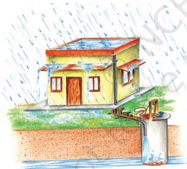
(b) Recharge through Abandoned Dugwell