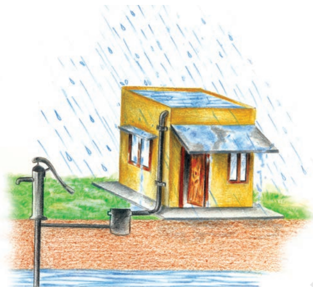
(a) Recharge through Hand Pump

irrigate their fields. In arid and semi-arid regions, agricultural fields were converted into rain fed storage structures that allowed the water to stand and moisten the soil like the 'khadins' in Jaisalmer and 'Johads' in other parts of Rajasthan.