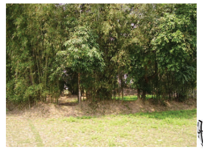
Fig. 4.3: Bamboo plantation in North-east