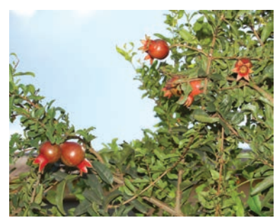
Fig. 4.12: Apricots, apple and pomegranate