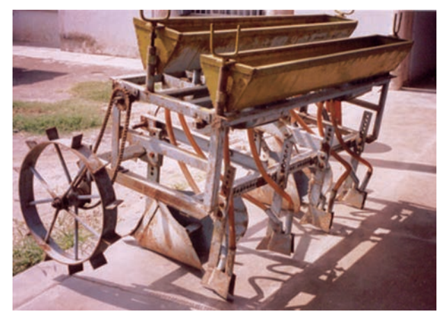
Fig. 4.15: Modern technological equipments used in agriculture

reforms. Provision for crop insurance against drought, flood, cyclone, fire and disease, establishment of Grameen banks, cooperative societies and banks for providing loan facilities to the farmers at lower rates of interest were some important steps in this direction.