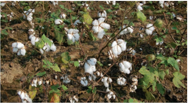
Fig. 4.14: Cotton Cultivation

Cotton: India is believed to be the original home of the cotton plant. Cotton is one of the main raw materials for cotton textile industry. In 2017, India was second largest producer of cotton after China. Cotton grows well in drier parts of the black cotton soil of the Deccan plateau. It requires high temperature, light rainfall or irrigation, 210 frost-free days and bright sun-shine for its growth. It is a kharif crop and requires 6 to 8 months to mature. Major cotton-producing states are—Maharashtra, Gujarat, Madhya Pradesh,