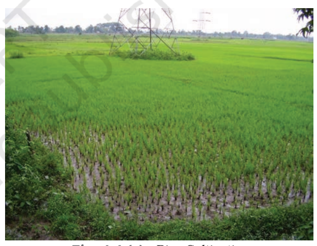
Fig. 4.4 (a): Rice Cultivation

Rice: It is the staple food crop of a majority of the people in India. Our country is the second largest producer of rice in the world after China. It is a kharif crop which requires high temperature, (above 25°C) and high humidity with annual rainfall above 100 cm. In the areas of less rainfall, it grows with the help of irrigation.