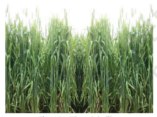
Fig. 4.5: Wheat Cultivation

Wheat: This is the second most important cereal crop. It is the main food crop, in north and north-western part of the country. This rabi crop requires a cool growing season and a bright sunshine at the time of ripening. It requires 50 to 75 cm of annual rainfall evenly-distributed over the growing season. There are two important wheat-growing zones in the country – the Ganga-Satluj plains in the north-west and black soil region of the Deccan. The major wheat-producing states are Punjab, Haryana, Uttar Pradesh, Madhya Pradesh, Bihar and Rajasthan.