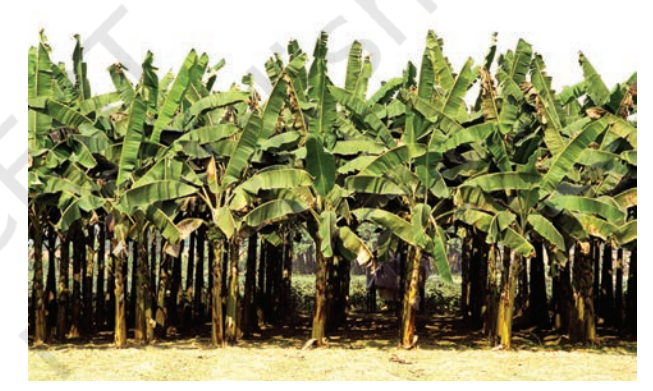
Fig. 4.2: Banana plantation in Southern part of India

In India, tea, coffee, rubber, sugarcane, banana, etc., are important plantation crops. Tea in Assam and North Bengal coffee in Karnataka are some of the important plantation crops grown in these states. Since the production is mainly for market, a well-developed network of transport and communication connecting the plantation areas, processing industries and markets plays an important role in the development of plantations.