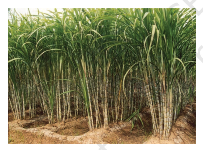
Fig. 4.8: Sugarcane Cultivation

Sugarcane: It is a tropical as well as a subtropical crop. It grows well in hot and humid climate with a temperature of 21°C to 27°C and an annual rainfall between 75cm. and 100cm. Irrigation is required in the regions of low rainfall. It can be grown on a variety of soils and needs manual labour from