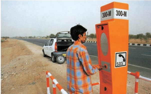
Fig.7.10 : Emergency call box on NH-8

Digital India is an umbrella programme to prepare India for a knowledge based transformation. The focus of Digital India Programme is on being transformative to realise – IT (Indian Talent) + IT (Information Technology)=IT (India Tomorrow) and is on making technology central to enabling change.