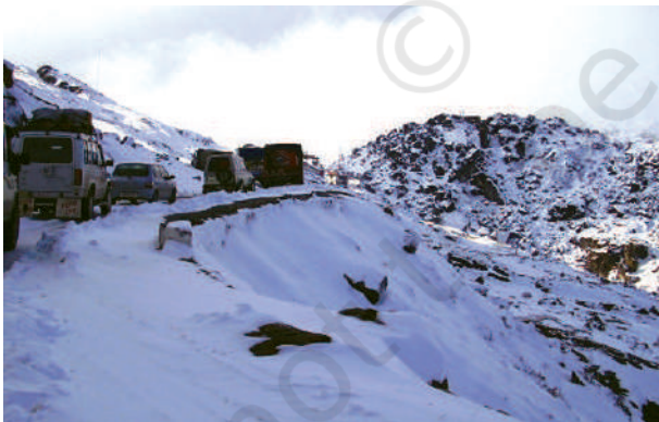
Fig. 7.4: Traffic on north-eastern border road (Arunachal Pradesh)

Roads can also be classified on the basis of the type of material used for their construction such as metalled and unmetalled roads. Metalled roads may be made of cement, concrete or even bitumen of coal, therefore,