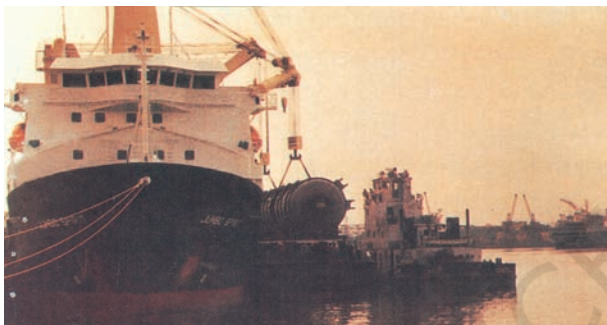
Fig. 7.8: Handling of oversize cargo at Tuticorin port

even our neighbouring countries like Sri Lanka, Maldives, etc. and the coastal regions of India. Chennai is one of the oldest artificial ports of the country. It is ranked next to Mumbai in terms of the volume of trade and cargo. Vishakhapatnam is the deepest landlocked and well-protected port. This port was, originally, conceived as an outlet for iron ore exports. Paradwip port located in Odisha, specialises in the export of iron ore. Kolkata is an inland riverine port. This port serves a very large and rich hinterland of Ganga-Brahmaputra basin. Being a tidal port, it requires constant dredging of Hoogly. Haldia port was developed as a subsidiary port, in order to relieve growing pressure on the Kolkata port.