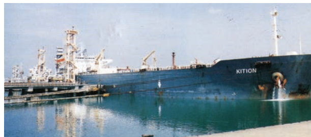
Fig. 7.7: Tanker discharging crude oil at New Mangalore port

Mumbai is the biggest port with a spacious natural and well-sheltered harbour. The Jawaharlal Nehru port was planned with a view to decongest the Mumbai port and serve as a hub port for this region. Marmagao port (Goa) is the premier iron ore exporting port of the country. This port accounts for about fifty per cent of India's iron ore export. New Mangalore port, located in Karnataka caters to the export of iron ore concentrates from Kudremukh mines. Kochchi is the extreme south-western port, located at the entrance of a lagoon with a natural harbour.