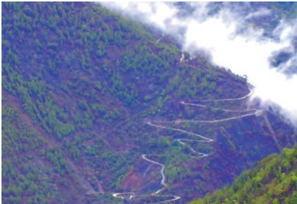
Fig. 7.3: Hilly Tracts