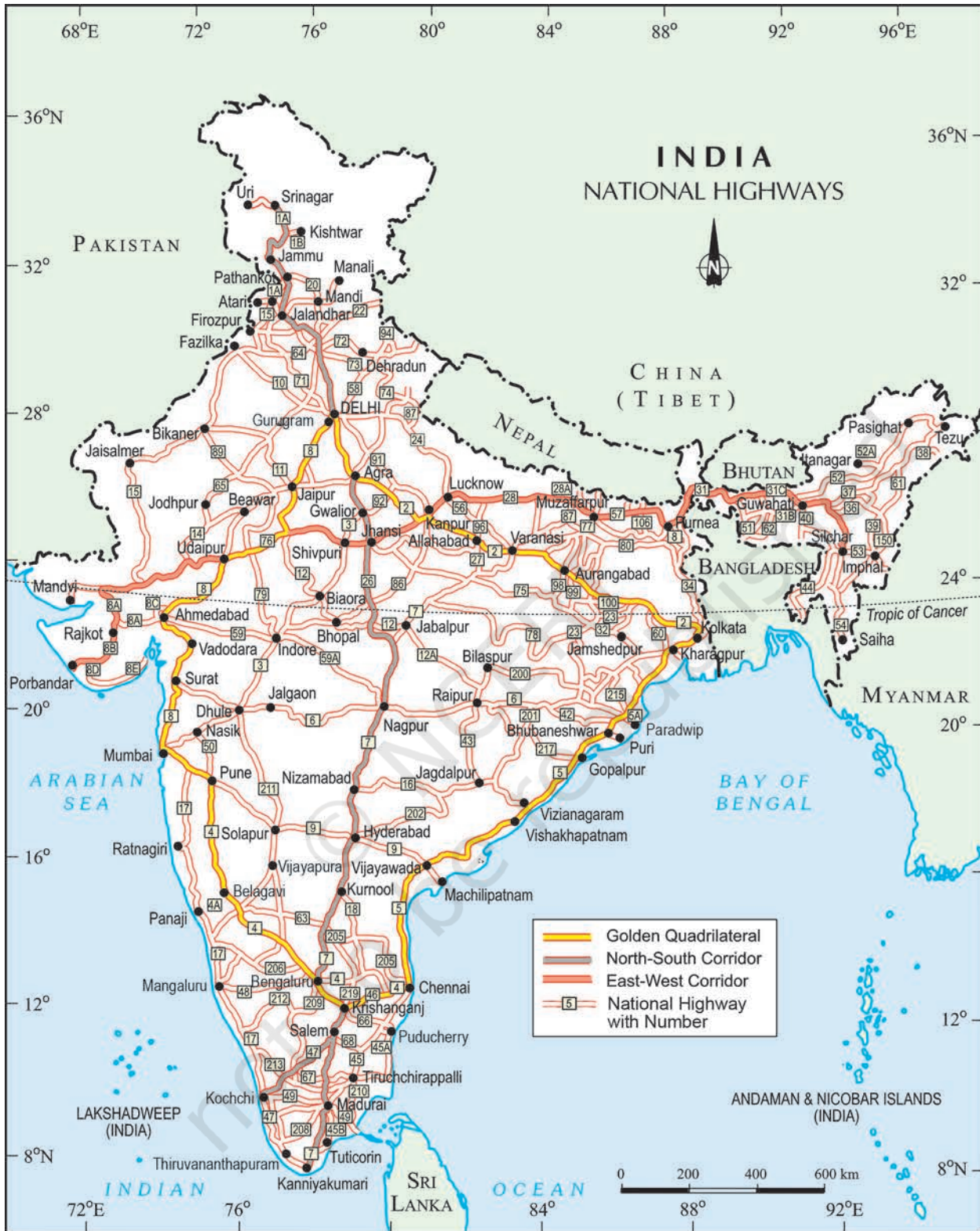
India: National Highways