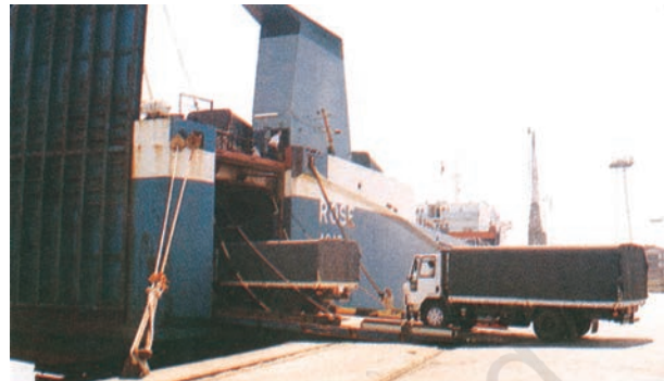
Fig. 7.6: Trucks being driven into the vessel at Mumbai port

Deendayal Port, is a tidal port. It caters to the convenient handling of exports and imports of highly productive granary and industrial belt stretching across UT of Jammu and Kashmir, and the states of Himachal Pradesh, Punjab, Haryana, Rajasthan and Gujarat.