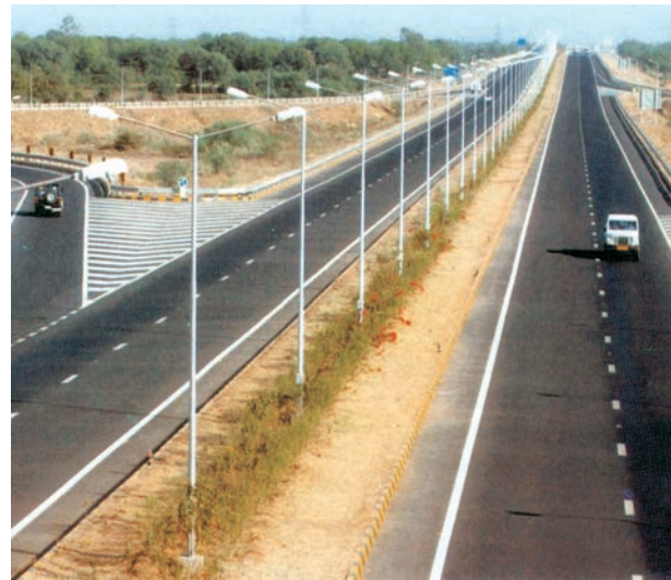
Fig. 7.2: Ahmedabad- Vadodara Expressway