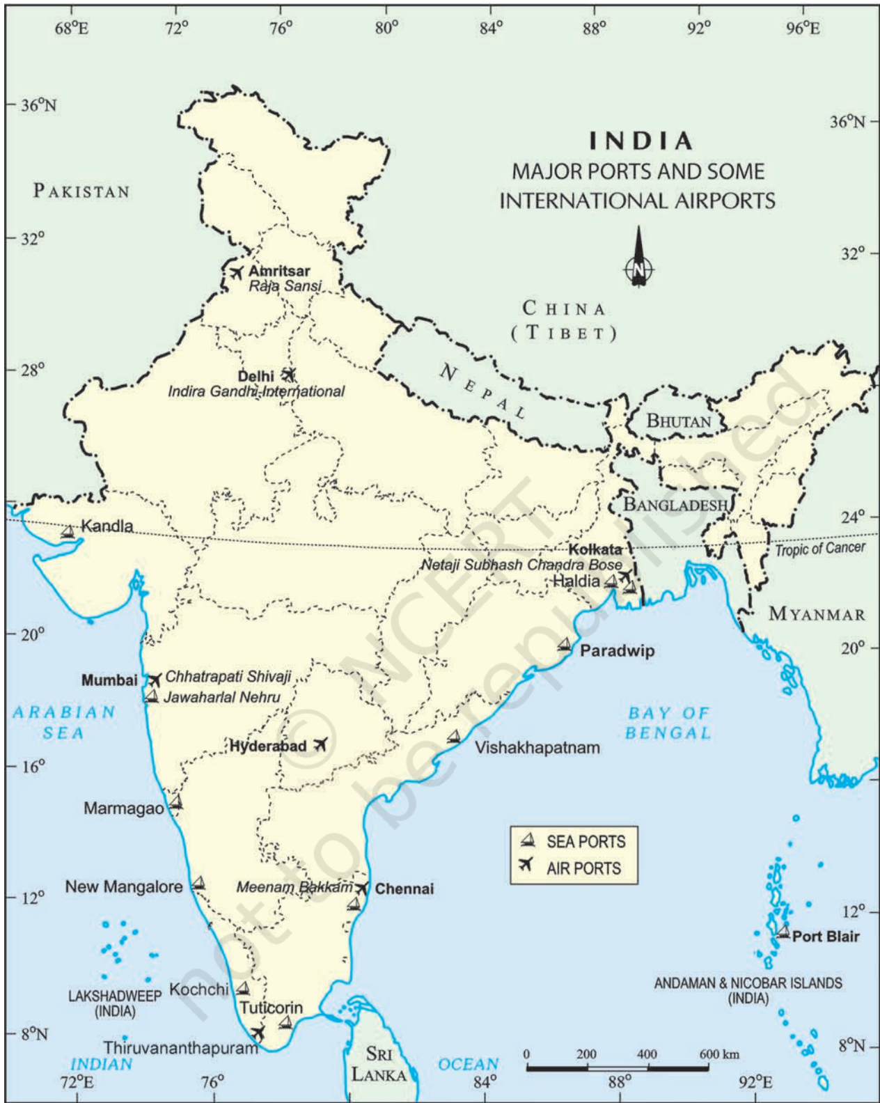
India: Major Ports and Some International Airports