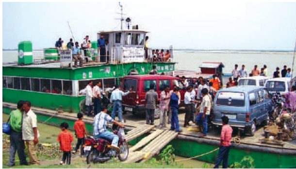
Fig. 7.5: Inland waterways widely used in north-eastern states