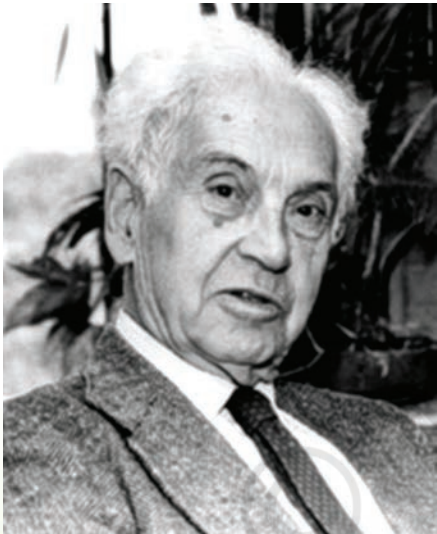
Ernst Mayr (1904 – 2004)

Born on 5 July 1904, in Kempten, Germany, ERNST MAYR, the Harvard University evolutionary biologist who has been called 'The Darwin of the 20 th century', was one of the 100 greatest scientists of all time. Mayr joined Harvard's Faculty of Arts and Sciences in 1953 and retired in 1975, assuming the title Alexander Agassiz Professor of Zoology Emeritus . Throughout his nearly 80-year career, his research spanned ornithology, taxonomy, zoogeography, evolution, systematics, and the history and philosophy of biology. He almost single-handedly made the origin of species diversity the central question of evolutionary biology that it is today. He also pioneered the currently accepted definition of a biological species. Mayr was awarded the three prizes widely regarded as the triple crown of biology: the Balzan Prize in 1983, the International Prize for Biology in 1994, and the Crafoord Prize in 1999. Mayr died at the age of 100 in the year 2004.