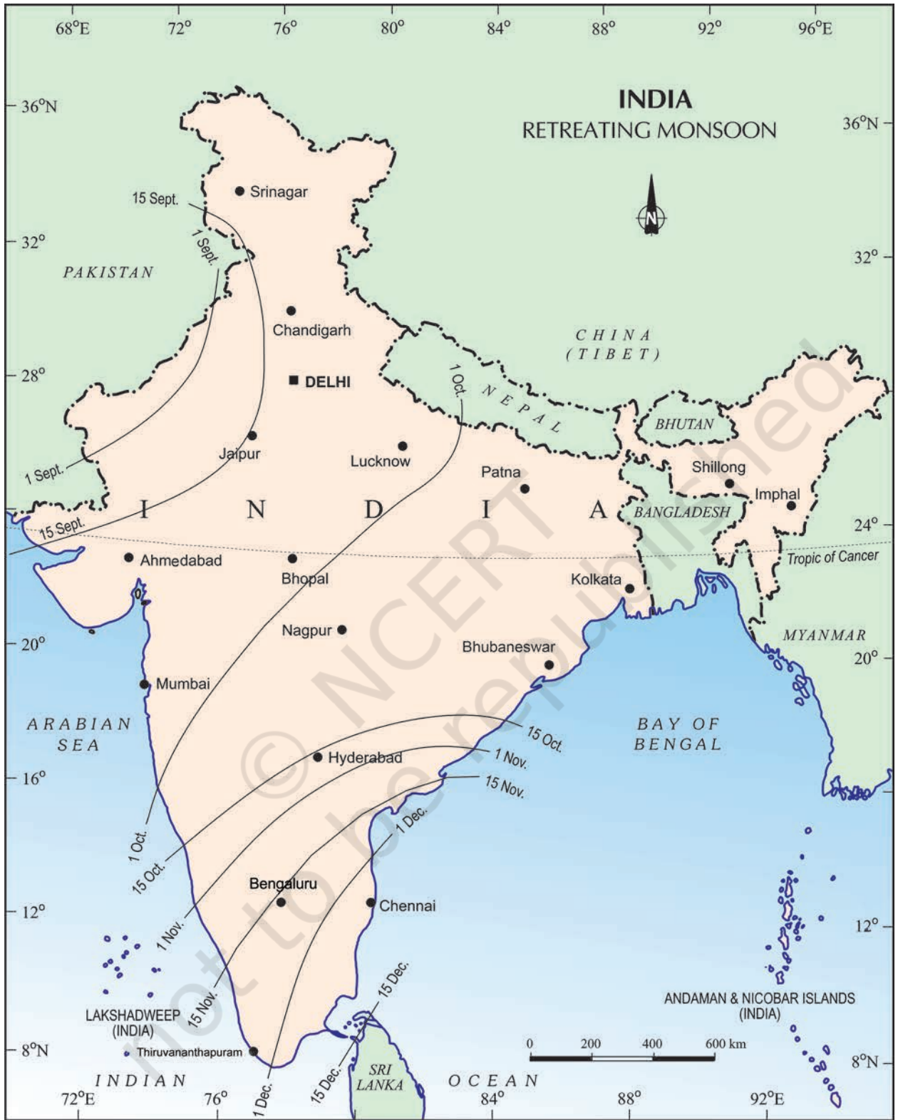
Figure 4.2 : Retreating Monsoon