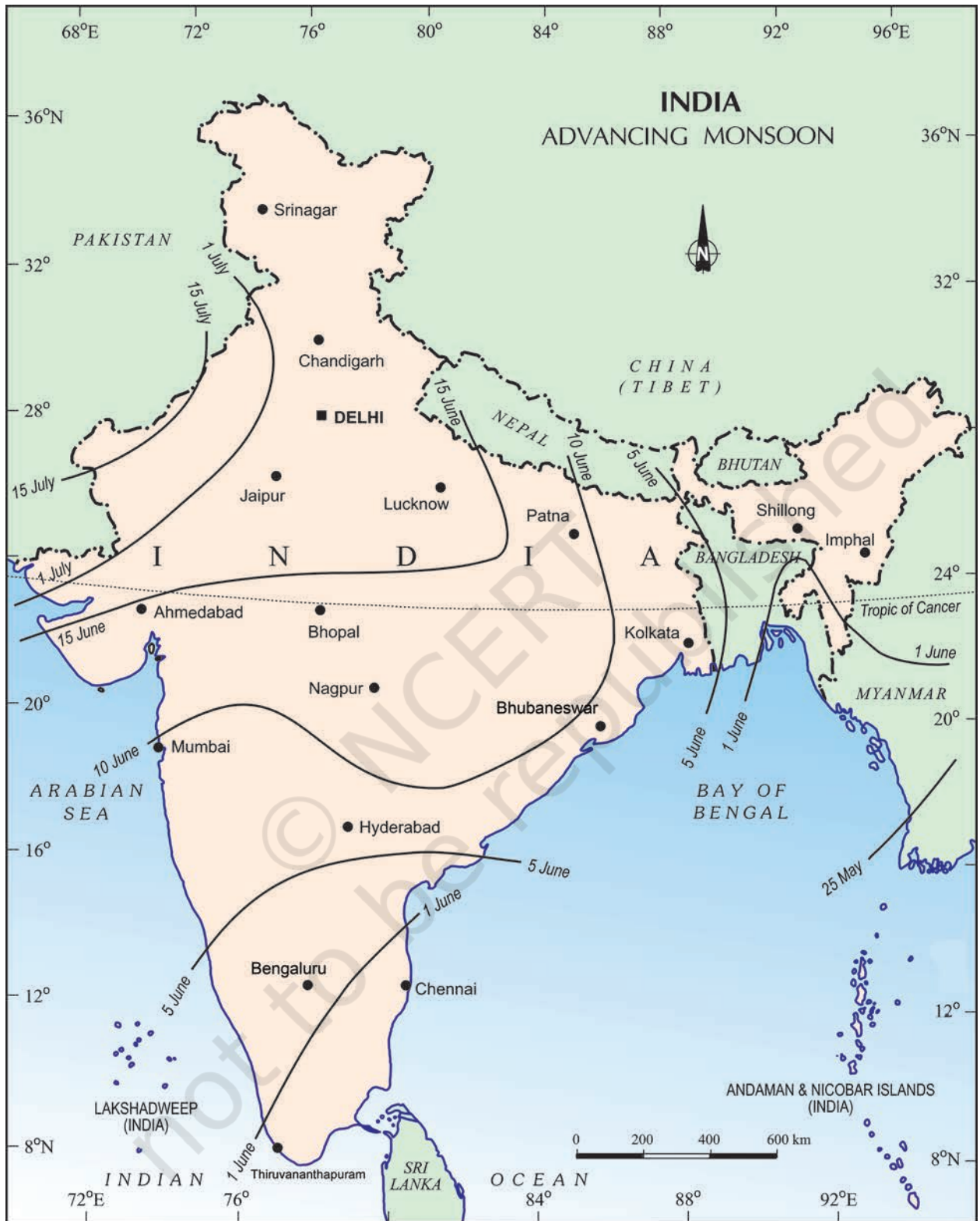
Figure 4.1 : Advancing Monsoon