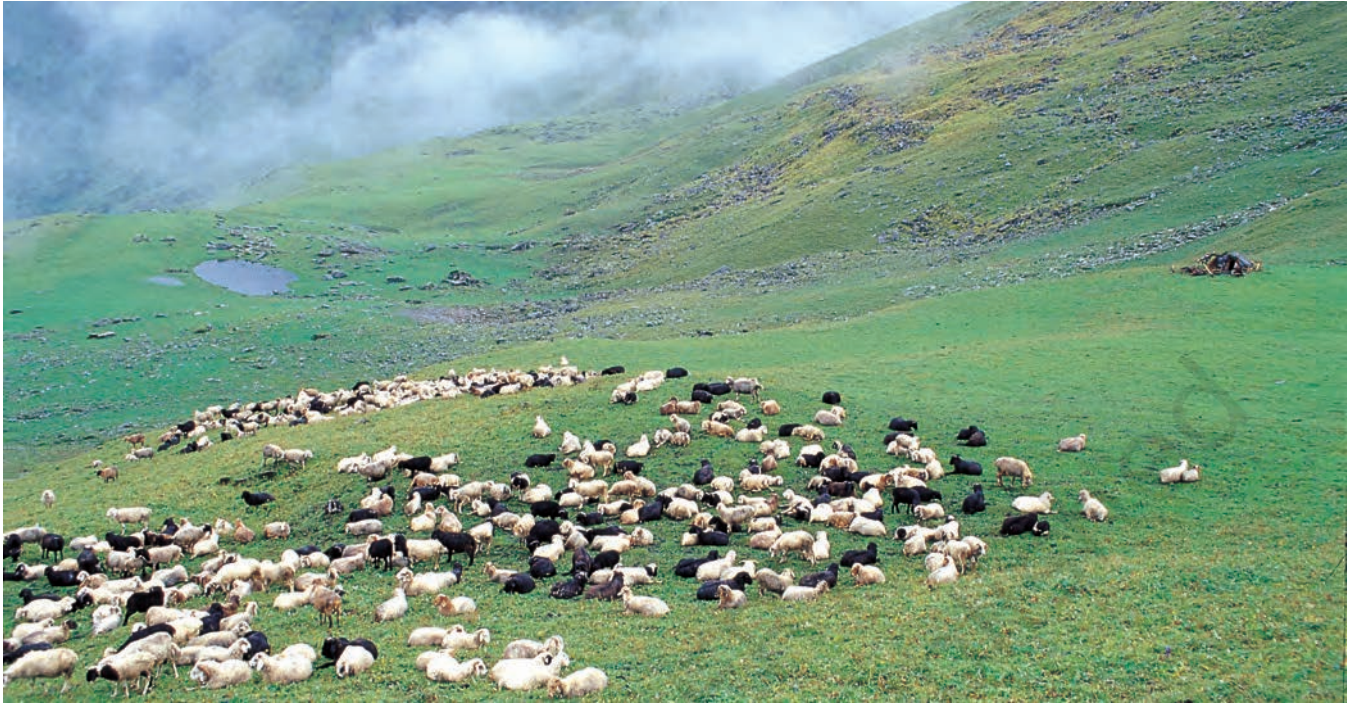
Fig. 1 – Sheep grazing on the Bugyals of eastern Garhwal.

Bugyals are vast natural pastures on the high mountains, above 12,000 feet. They are under snow in the winter and come to life after April. At this time the entire mountainside is covered with a variety of grasses, roots and herbs. By monsoon, these pastures are thick with vegetation and carpeted with wild flowers.