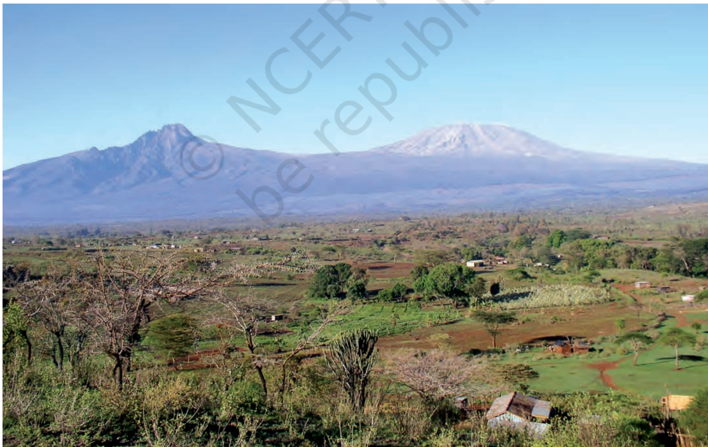
Fig. 12 – A view of Maasai land with Kilimanjaro in the background.

Like pastoralists in India, the lives of African pastoralists have changed dramatically over the colonial and post-colonial periods. What have these changes been?