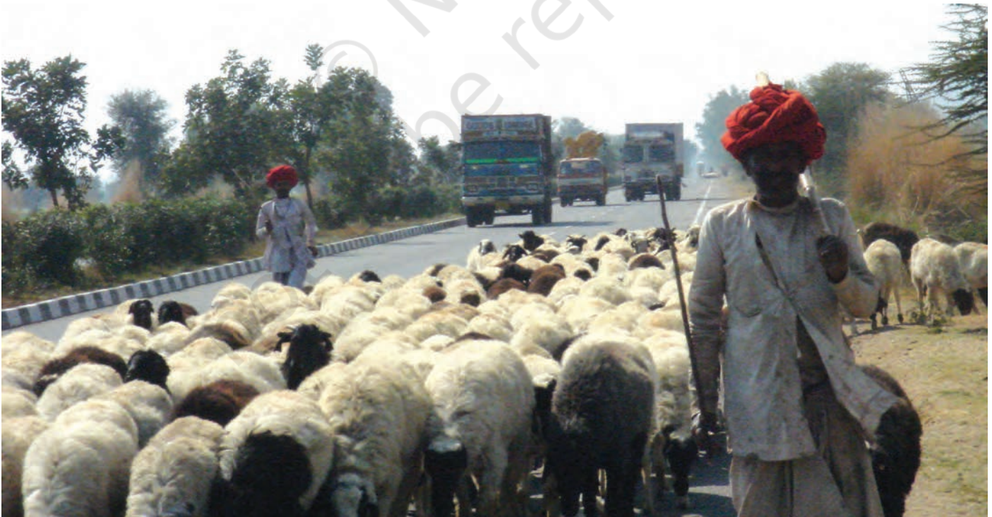
Fig. 18 – A Raika shepherd on Jaipur highway. Heavy traffic on highways has made migration of shepherds a new experience.

Yet, pastoralists do adapt to new times. They change the paths of their annual movement, reduce their cattle numbers, press for rights to enter new areas, exert political pressure on the government for relief, subsidy and other forms of support and demand a right in the management of forests and water resources. Pastoralists are not relics of the past. They are not people who have no place in the modern world. Environmentalists and economists have increasingly come to recognise that pastoral nomadism is a form of life that is perfectly suited to many hilly and dry regions of the world.