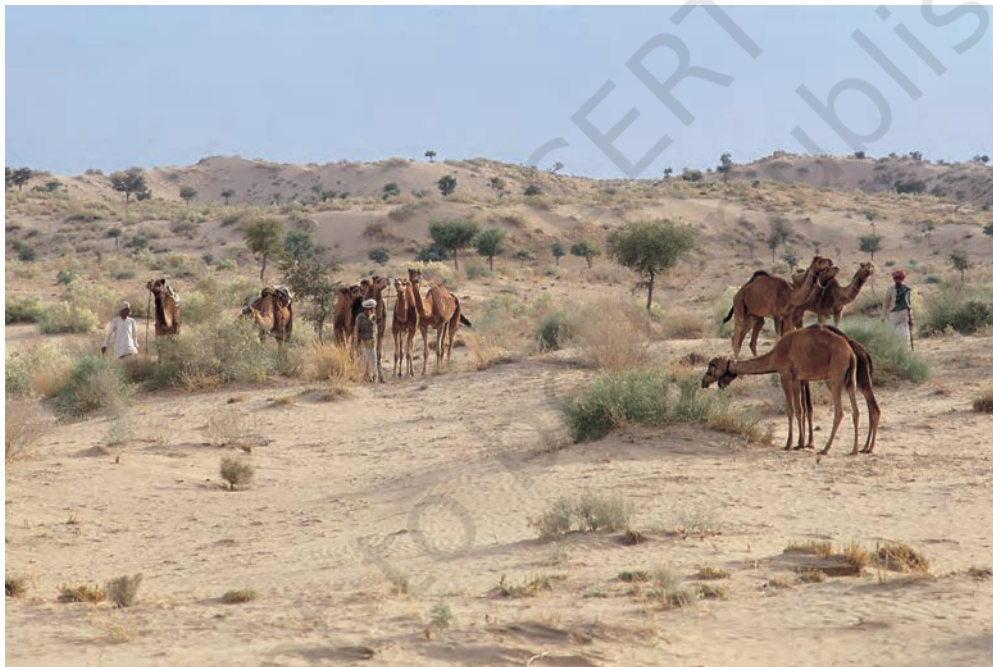
Fig.5 – Raika camels grazing on the Thar desert in western Rajasthan. Only camels can survive on the dry and thorny bushes that can be found here; but to get enough feed they have to graze over a very extensive area.

Dhangars were an important pastoral community of Maharashtra. In the early twentieth century their population in this region was estimated to be 467,000. Most of them were shepherds, some were blanket weavers, and still others were buffalo herders. The Dhangar shepherds stayed in the central plateau of Maharashtra during the monsoon. This was a semi-arid region with low rainfall and poor soil. It was covered with thorny scrub. Nothing but dry crops like bajra could be sown here. In the monsoon this tract became a vast grazing ground for the Dhangar flocks. By October the Dhangars harvested their bajra and started on their move west. After a march of about a month they reached the Konkan. This was a flourishing agricultural tract with high rainfall and rich soil. Here the shepherds