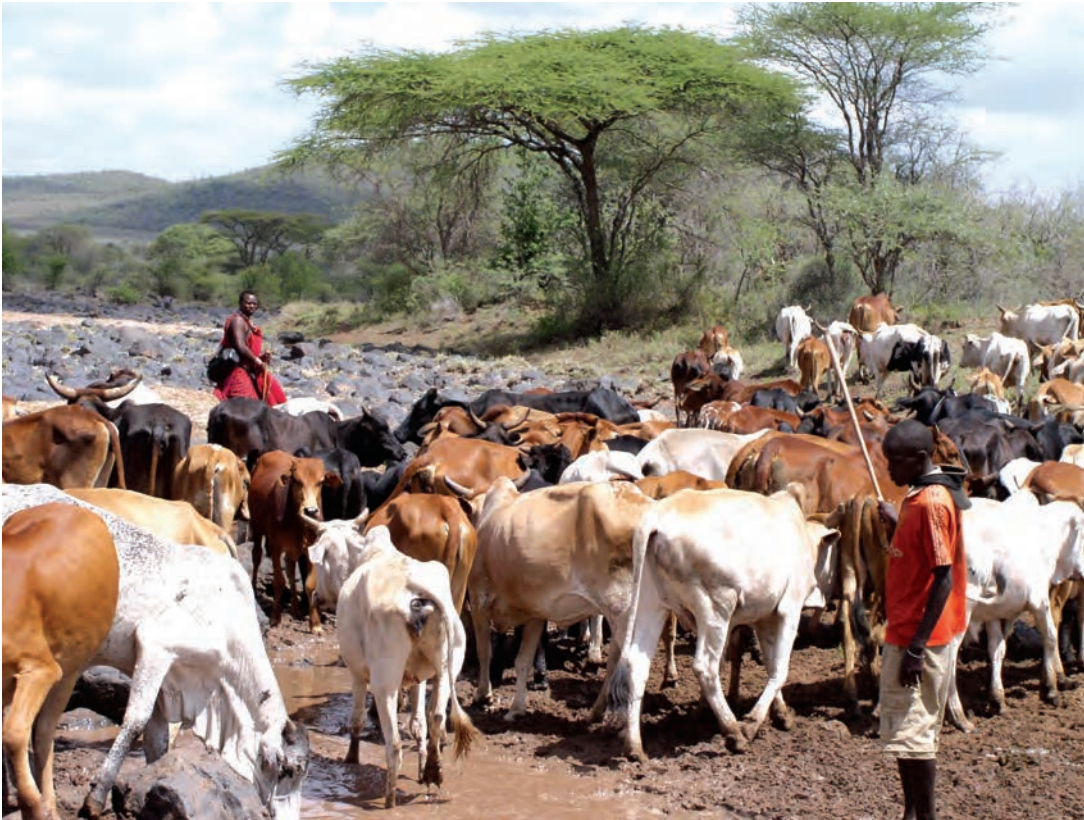
Fig. 15 – The title Maasai derives from the word Maa. Maa-sai means 'My People'. The Maasai are traditionally nomadic and pastoral people who depend on milk and meat for subsistence. High temperatures combine with low rainfall to create conditions which are dry, dusty, and extremely hot. Drought conditions are common in this semi-arid land of equatorial heat. During such times pastoral animals die in large numbers.