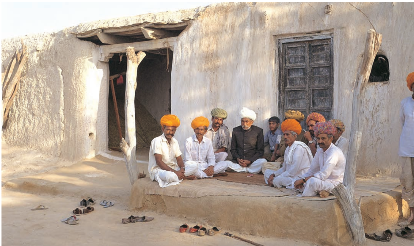
Fig.9 – A Maru Raika genealogist with a group of Raikas.

The genealogist recounts the history of the community. Such oral traditions give pastoral groups their own sense of identity. These oral traditions can tell us about how a group looks at its own past.