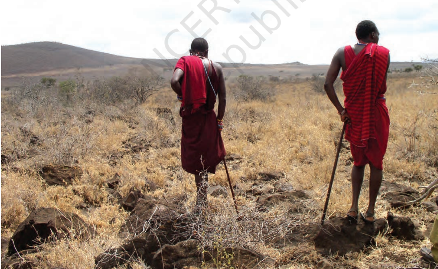
Fig. 14 – Without grass, livestock (cattle, goats and sheep) are malnourished, which means less food available for families and their children. The areas hardest hit by drought and food shortage are in the vicinity of Amboseli National Park, which last year generated approximately 240 million Kenyan Shillings (estimated $3.5 million US) from tourism. In addition, the Kilimanjaro Water Project cuts through the communities of this area but the villagers are barred from using the water for irrigation or for livestock.

Large areas of grazing land were also turned into game reserves like the Maasai Mara and Samburu National Park in Kenya and Serengeti Park in Tanzania. Pastoralists were not allowed to enter these reserves; they could neither hunt animals nor graze their herds in these areas. Very often these reserves were in areas that had traditionally been regular grazing grounds for Maasai herds. The Serengeti National Park, for instance, was created over 14,760 km. of Maasai grazing land.