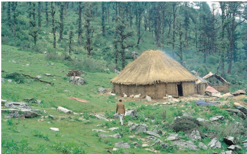
Fig. 2 – A Gujjar Mandap on the high mountains in central Garhwal.

From: G.C. Barnes, Settlement Report of Kangra, 1850-55.