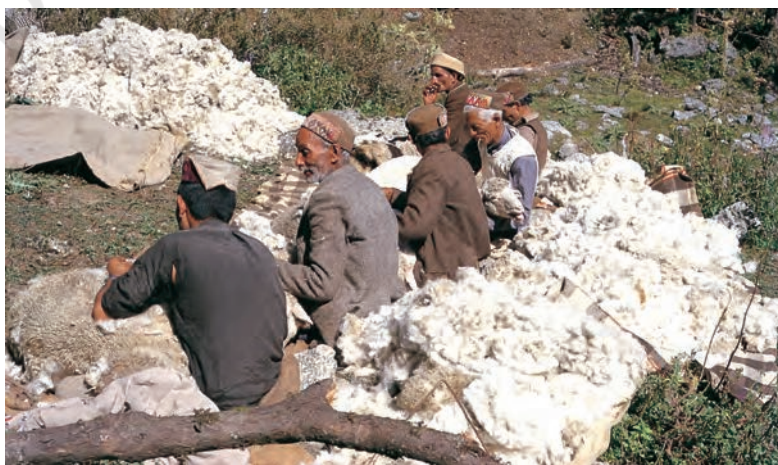
Fig.4 – Gaddi sheep being sheared.

Bugyal – Vast meadows in the high mountains