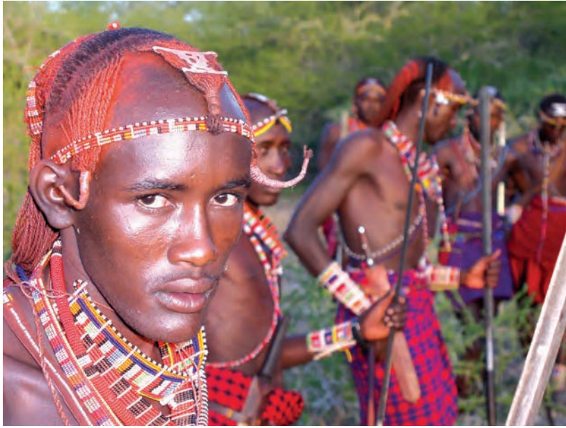
Fig. 17 - Even today, young men go through an elaborate ritual before they become warriors, although actually it is no longer common. They must travel throughout the section's region for about four months, ending with an event where they run to the homestead and enter with an attitude of a raider. During the ceremony, boys dress in loose clothing and dance non-stop throughout the day. This ceremony is the transition into a new age. Girls are not required to go through such a ritual.

To administer the affairs of the Maasai, the British introduced a series of measures that had important implications. They appointed chiefs of different sub-groups of Maasai, who were made responsible for the affairs of the tribe. The British imposed various restrictions on raiding and warfare. Consequently, the traditional authority of both elders and warriors was adversely affected.