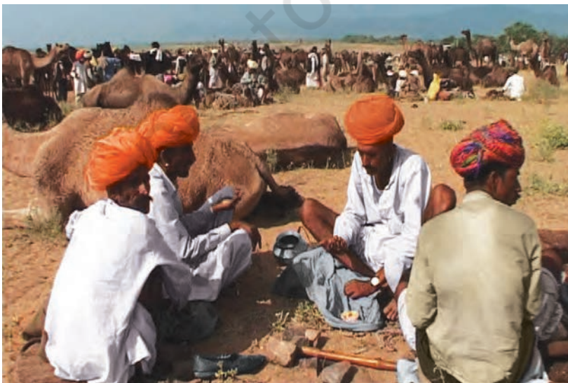
Fig. 8 – A camel fair at Pushkar.

How did the life of pastoralists change under colonial rule?