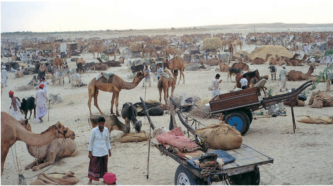
Fig. 7 – A camel fair at Balotra in western Rajasthan. Camel herders come to the fair to sell and buy camels. The Maru Raikas also display their expertise in training their camels. Horses from Gujarat are also brought for sale at this fair.

So we see that the life of these pastoral groups was sustained by a careful consideration of a host of factors. They had to judge how long the herds could stay in one area, and know where they could find water and pasture. They needed to calculate the timing of their movements, and ensure that they could move through different territories. They had to set up a relationship with farmers on the way, so that the herds could graze in harvested fields and manure the soil. They combined a range of different activities – cultivation, trade, and herding – to make their living.