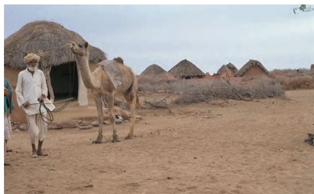
Fig. 6 – A camel herder in his settlement. This is on the Thar desert near Jaisalmer in Rajasthan. The camel herders of the region are Maru (desert) Raikas, and their settlement is called a dhandi.