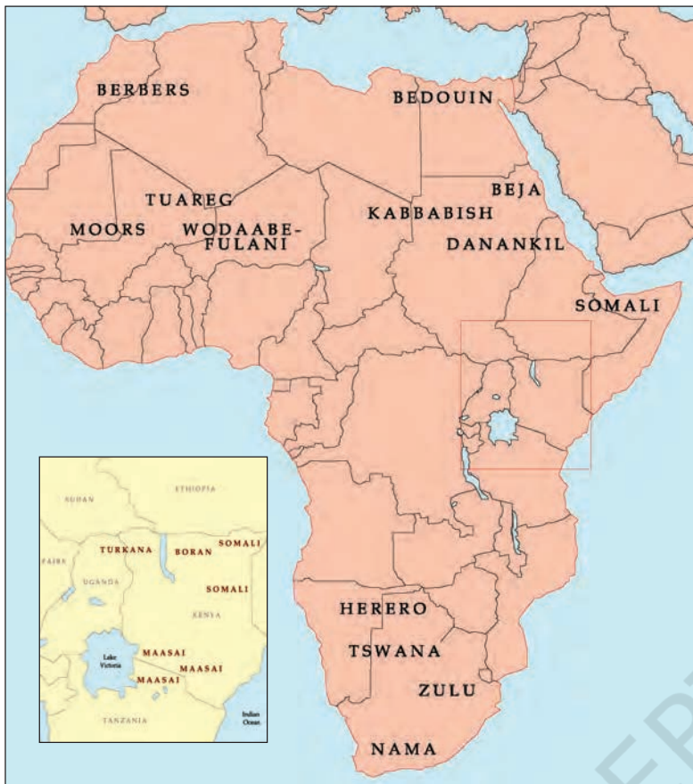
Fig. 13 – Pastoral communities in Africa. The inset shows the location of the Maasais in Kenya and Tanzania.

We will discuss some of these changes by looking at one pastoral community – the Maasai – in some detail. The Maasai cattle herders live primarily in east Africa: 300,000 in southern Kenya and another 150,000 in Tanzania. We will see how new laws and regulations took away their land and restricted their movement. This affected their lives in times of drought and even reshaped their social relationships.