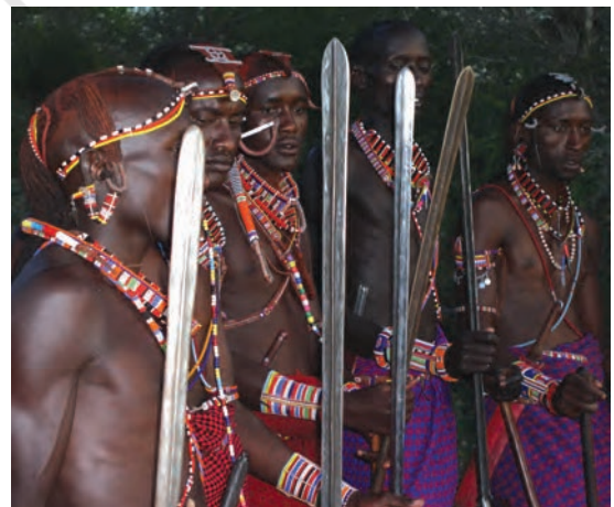
Fig. 16 – Note how the warriors wear traditional deep red shukas, brightly beaded Maasai jewelry and carry five-foot, steel tipped spears. Their long pleats of intricately plaited hair are tinted red with ochre. As per tradition they face East to honour the rising sun. Warriors are in charge of society's security while boys are responsible for herding livestock. During the drought season, both warriors and boys assume responsibility for herding livestock.

In Maasailand, as elsewhere in Africa, not all pastoralists were equally affected by the changes in the colonial period. In pre-colonial times Maasai society was divided into two social categories – elders and warriors. The elders formed the ruling group and met in periodic councils to decide on the affairs of the community and settle disputes. The warriors consisted of younger people, mainly responsible for the protection of the tribe. They defended the community and organised cattle raids. Raiding was important in a society where cattle was wealth. It is through raids that the power of different pastoral groups was asserted. Young men came to be recognised as members of the warrior class when they proved their manliness by raiding the cattle of other pastoral groups and participating in wars. They, however, were subject to the authority of the elders.