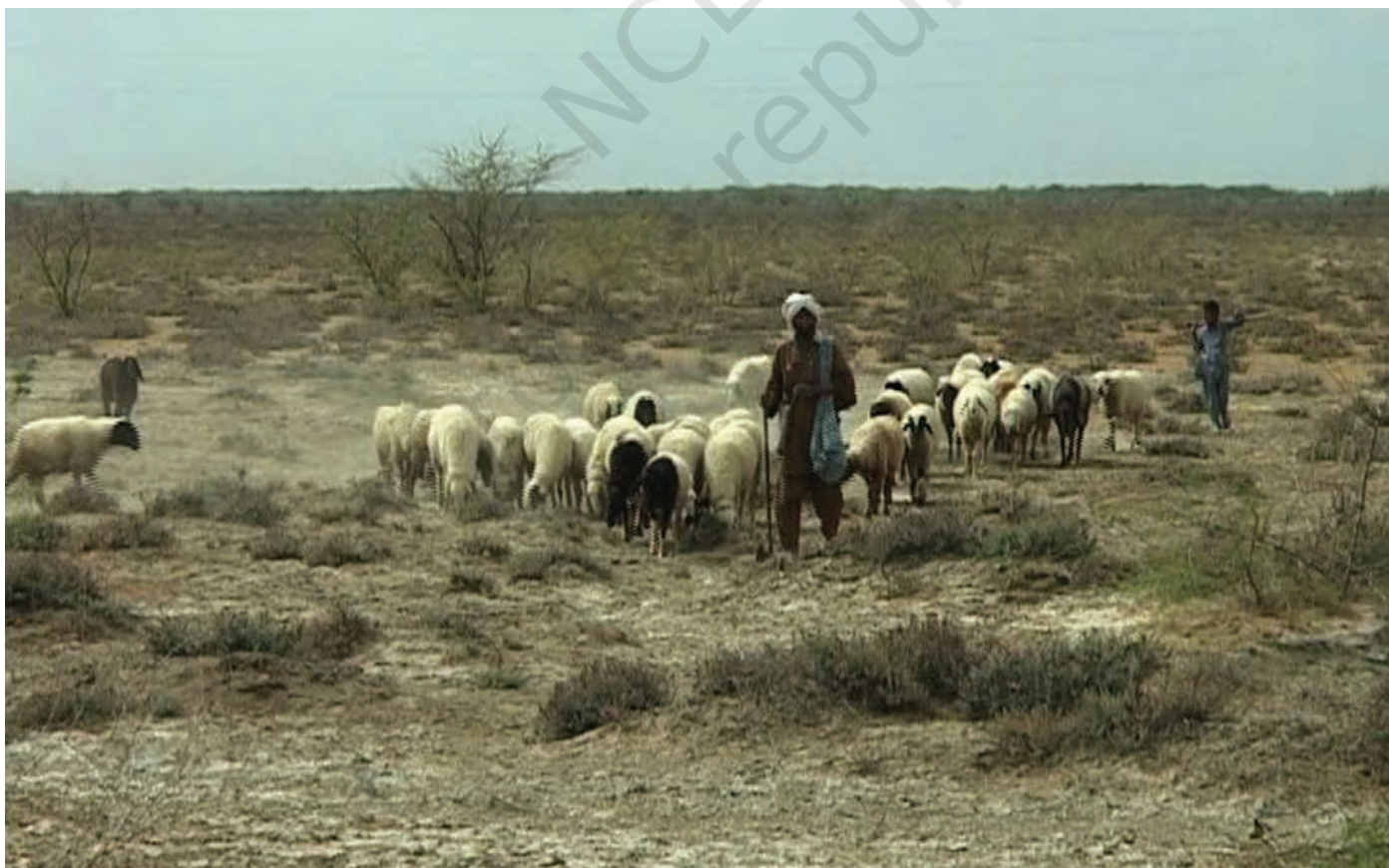
Fig.10 – Maldhari herders moving in search of pastures. Their villages are in the Rann of Kutch.

The genealogist recounts the history of the community. Such oral traditions give pastoral groups their own sense of identity. These oral traditions can tell us about how a group looks at its own past.