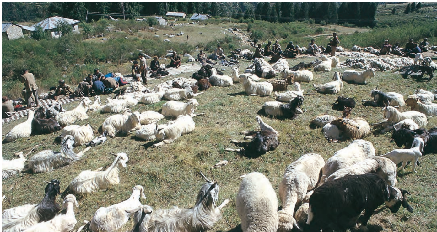
Fig.3 – Gaddis waiting for shearing to begin. Uhl valley near Palampur in Himachal Pradesh.

meadows. By September they began their return movement. On the way they stopped once again in the villages of Lahul and Spiti, reaping their summer harvest and sowing their winter crop. Then they descended with their flock to their winter grazing ground on the Siwalik hills. Next April, once again, they began their march with their goats and sheep, to the summer meadows.