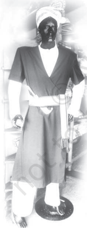
Traditional Coorgi dress