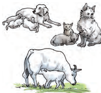
Fig. 6.14 Some animals which give birth to their young ones

Plants also reproduce. Like animals, plants also differ in their mode of reproduction. Many plants reproduce through seeds. Plants produce seeds,