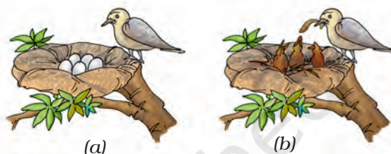
Fig. 6.13 (a) Birds lay eggs which after hatching produce (b) young ones

Many birds lay their eggs in the nest. Some of the eggs hatch and young birds come out of them (Fig. 6.13).