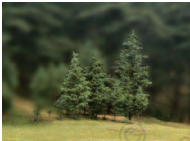
Fig. 6.6 Trees of a mountain habitat

There is a large variety of plants and animals living in the mountain regions. Have you seen the kind of trees shown in Fig. 6.6?