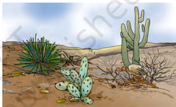
Fig. 6.5 Some typical plants that grow in desert

Leave the potted plants in the sun and observe after a few hours. What do you see? Do you notice any difference in the amount of water collected in the two polythene bags?