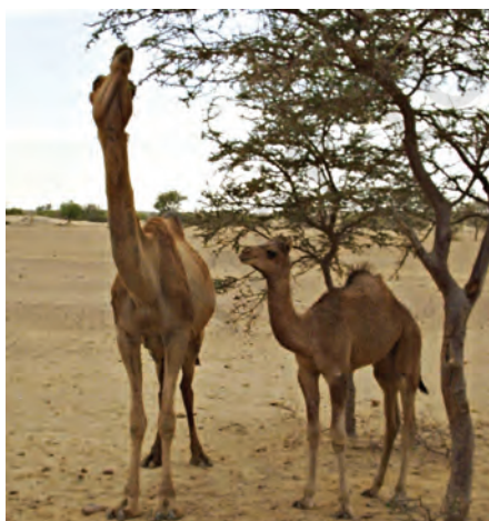
Fig. 6.2 Camels in their surroundings

The plants and animals that live on land are said to live in terrestrial habitats . Some examples of terrestrial habitats are forests, grasslands, deserts, coastal and mountain regions. On the other hand, the habitats of plants and