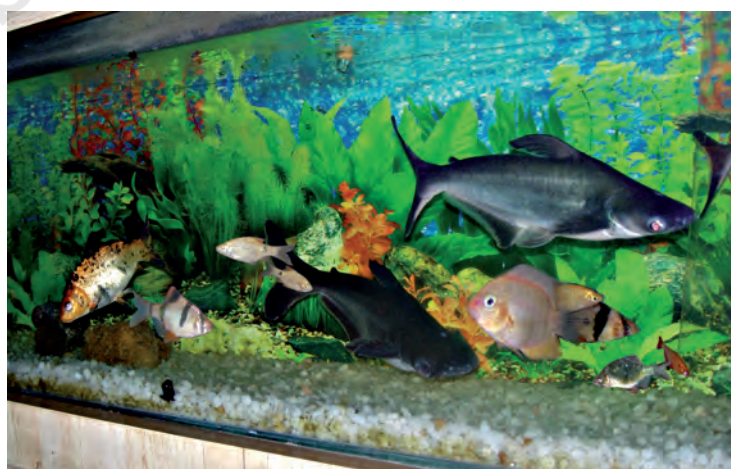
Fig. 6.3 Different kinds of fish