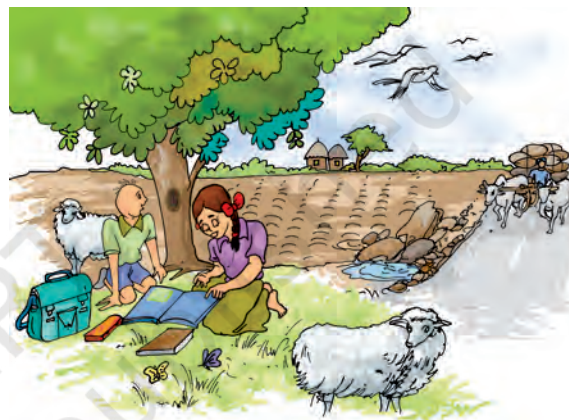
Fig. 6.1 Search for living organisms

of some kind or the other (Fig. 6.1). Paheli started thinking and reading about far away places. She read that people have even found tiny living organisms in the openings of volcanoes!