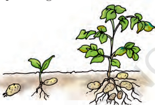
Fig. 6.16 A new plant grows from a bud of potato

Some plants also reproduce through parts other than seeds. For example, a part of a potato with a bud, grows into a new plant (Fig. 6.16).