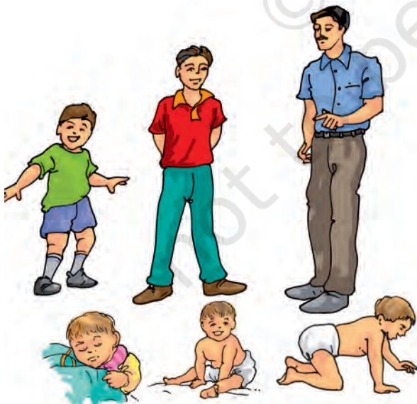
Fig. 6.10 A baby grows into an adult

Young ones of animals also grow into adults. You would surely have