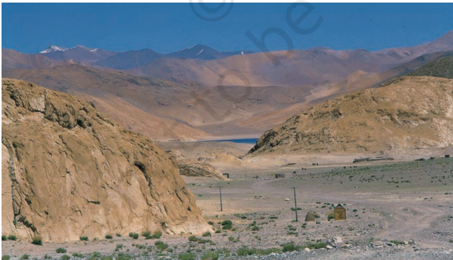
The dry barren landscape of the mountainous desert of Ladakh.

Ladakh is a desert in the mountains in the east of Jammu and Kashmir. Very little agriculture is possible here since this region does not receive any rain and is covered in snow for a large part of the year. There are very few trees that can grow in the region. For drinking water, people depend on the melting snow during the summer months.