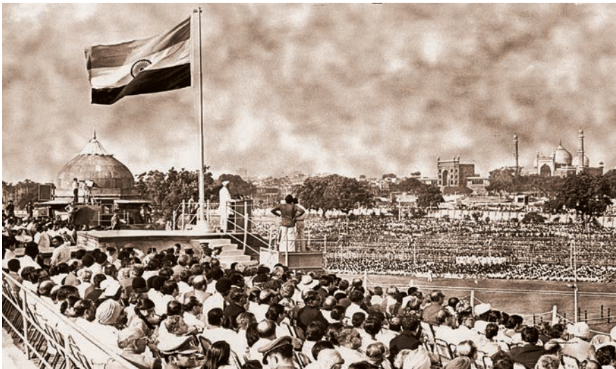
Pt. Nehru delivering an Independence Day speech

Songs and symbols that emerged during the freedom struggle serve as a constant reminder of our country's rich tradition of respect for diversity. Do you know the story of the Indian flag? It was used as a symbol of protest against the British by people everywhere.