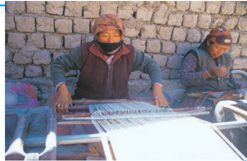
Woman weaving a pashmina shawl

Buddhism reached Tibet via Ladakh. Ladakh is also called Little Tibet. Islam was introduced in this region more than four hundred years ago and there is a significant Muslim population here. Ladakh has a very rich oral tradition of songs and poems. Local versions of the Tibetan national epic the Kesar Saga are performed and sung by both Muslims and Buddhists.