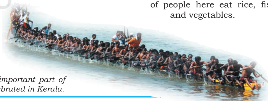
The boat race is an important part of the Onam festival celebrated in Kerala.

The fishing nets used here look exactly like the Chinese fishing nets and are called cheena-vala. Even the utensil used for frying is called the cheenachatti, and it is believed that the word cheen could have come from China. The fertile land and climate are suited to growing rice and a majority of people here eat rice, fish and vegetables.