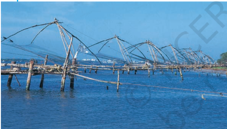
Chinese Fishing Nets

Many Arab traders also came and settled down here. Ibn Battuta, who travelled here a little less than seven hundred years ago, wrote a travelogue in which he describes the lives of Muslims and says that they were a highly respected community. The Portuguese discovered the sea route to India from Europe when Vasco da Gama landed with his ship here.