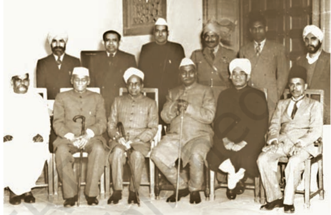
Some of the members who wrote the Constitution of India.

The writers of the Constitution also said that respect for diversity was a significant element in ensuring equality. They felt that people must have the freedom to follow their religion, speak their language, celebrate their festivals and express themselves freely. They