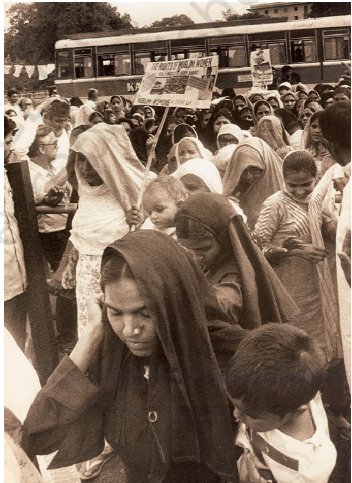
Women at a rally demanding their rights

As pointed out earlier, many Dalits organised themselves to gain entry into temples. Women demanded that they should have as much a right to