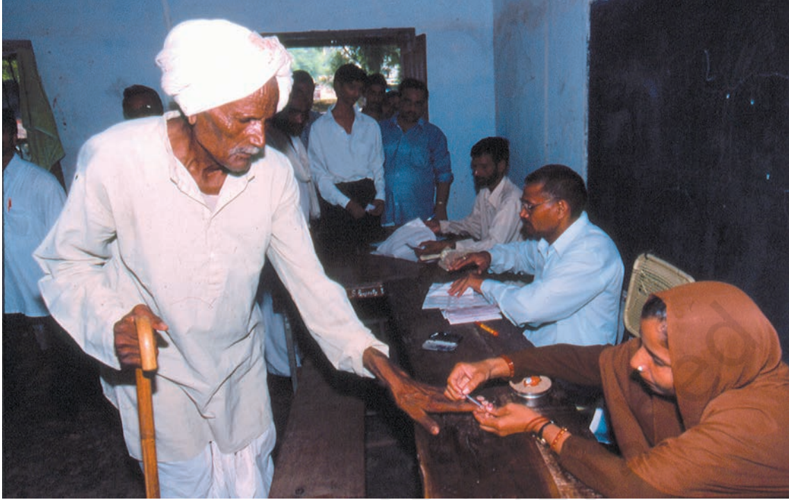
Voting in a rural area: A mark is put on the finger to make sure that a person casts only one vote.

election process. These representatives meet and make decisions for the entire population. These days a government cannot call itself democratic unless it allows what is known as universal adult franchise. This means that all adults in the country are allowed to vote.