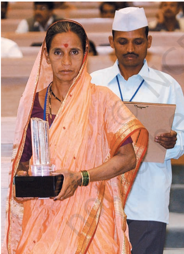
Two village Panchs from Maharashtra who were awarded the Nirmal Gram Puruskar in 2005 for the excellent work done by them in the Panchayat.

In some states, Gram Sabhas form committees like construction and development committees. These committees include some members of the Gram Sabha and some from the Gram Panchayat who work together to carry out specific tasks.