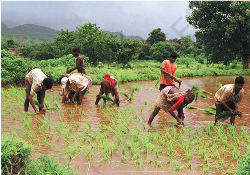
Transplanting paddy is back-breaking work.

The village is surrounded by low hills. Paddy is the main crop that is grown in irrigated lands. Most of the families earn a living through agriculture.