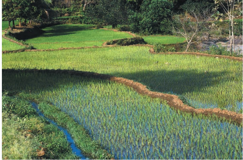
Transplanted paddy growing in a few of Ramalingam's 20 acres. A result of hard labour performed by agricultural workers like Thulasi.

This is when we can say they are caught in debt. In recent years this has become a major cause of distress among farmers. In some areas this has also resulted in many farmers committing suicide.