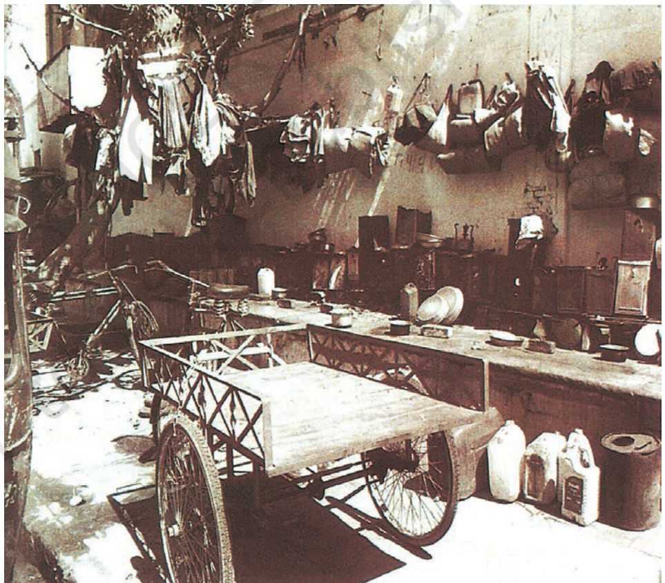
Often workers who make a living in the city are forced to set up their homes on the street as well. Below is a space where several workers leave their belongings during the day and cook their meals at night.

Vendors sell things that are often prepared at home by their families who purchase, clean, sort and make them ready to sell. For example, those who sell food or snacks on the street, prepare most of these at home.