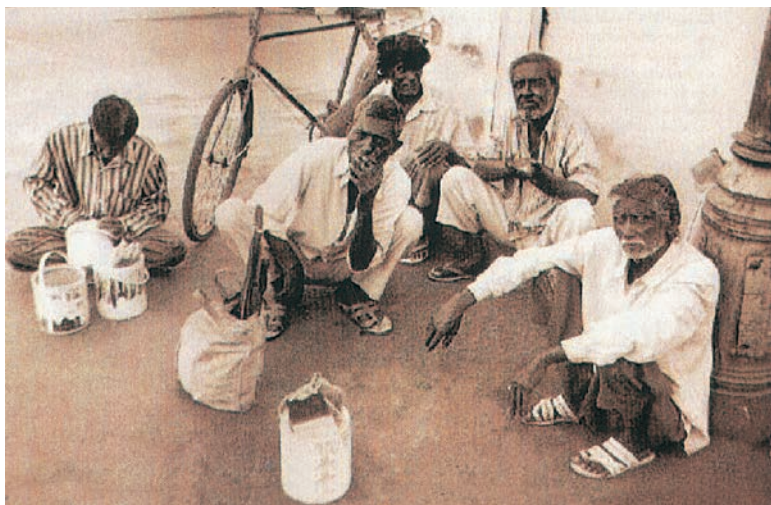
At labour chowk, daily wage workers wait with their tools for people to come and take them for work.

construction sites, lift loads or unload trucks in the market, dig pipelines and telephone cables and also build roads. There are thousands of such casual workers in the city.