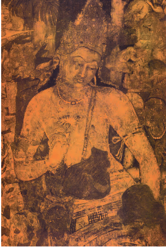
Paintings from Ajanta. Describe what you see in each of these paintings.

chance to visit any of these buildings, remember how several hundreds of people probably worked to construct and decorate them.