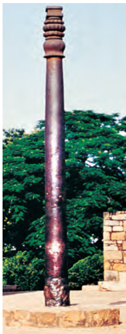
The iron pillar

date because there is an inscription on the pillar mentioning a ruler named Chandra, who probably belonged to the Gupta dynasty (Chapter 9). What is amazing is the fact that the pillar has not rusted through the centuries.