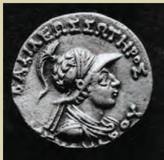
An Indo-Greek coin

The Mauryan empire collapsed about 2200 years ago. In its place (and elsewhere) rose several new kingdoms. In the north-west, and in parts of north India, kings known as the Indo-Greeks ruled for about one hundred years. They were followed by a Central