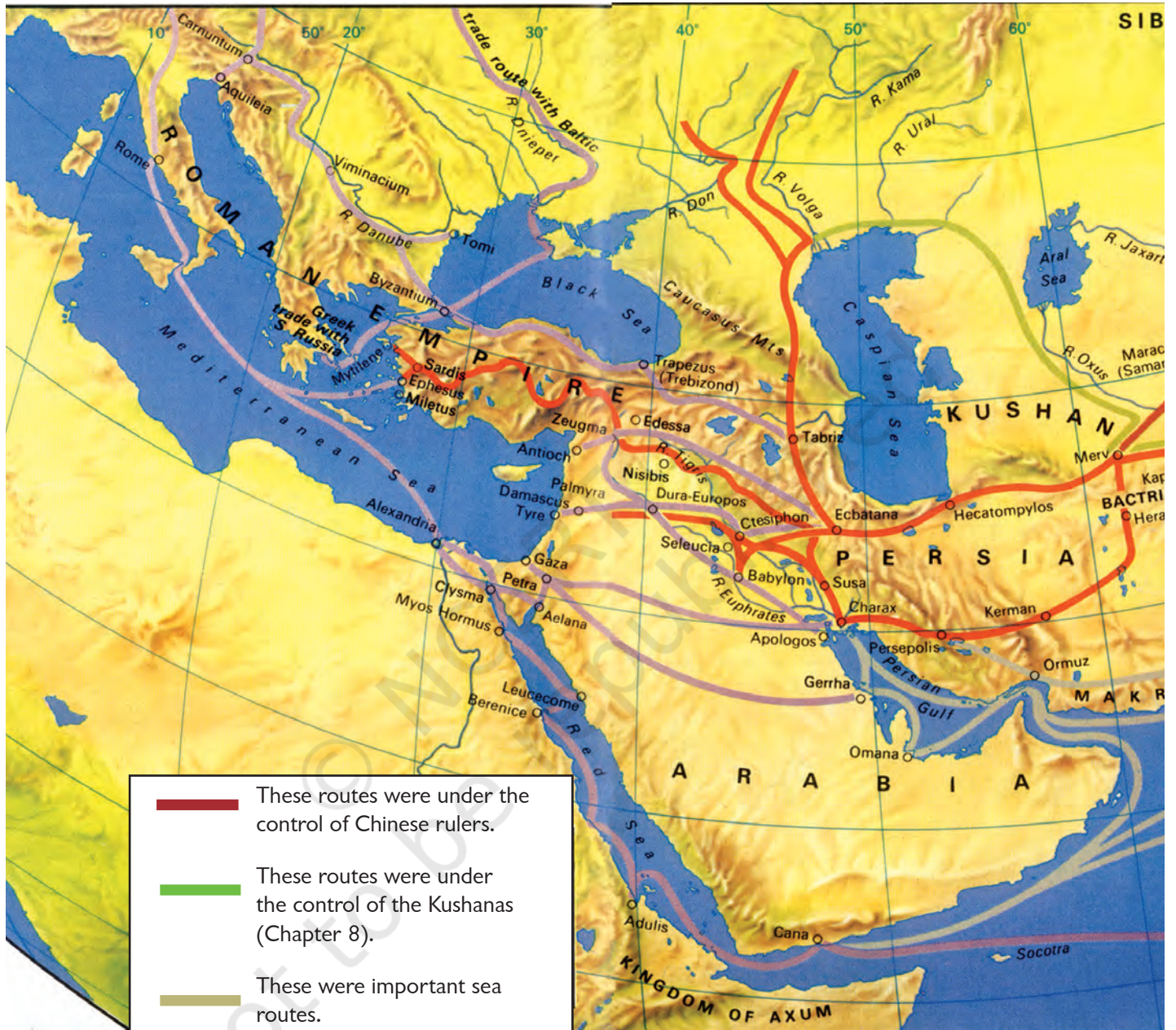
Map : 6 Showing Important Trade Routes including the Silk Route