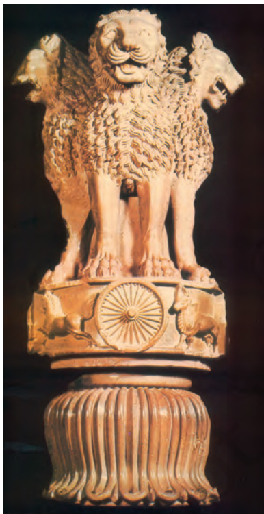
The lion capital

The lions that we see on our notes and coins have a long history. They were carved in stone, and placed on top of a massive stone pillar at Sarnath (about which you read in Chapter 6).