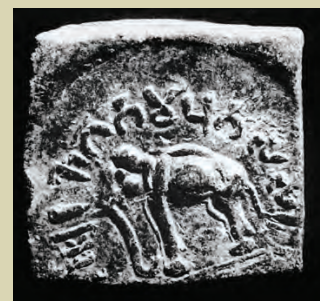
A Satavahana coin

Traders explored land routes within the subcontinent and outside, and sea routes to West Asia, East Africa and South East Asia (see Map 6) were also opened up. And many new buildings were built — including the earliest temples and stupas , books were written, and scientific discoveries were made. These developments took place simultaneously , i.e. at the same time. Keep this in mind as you read the rest of the book.