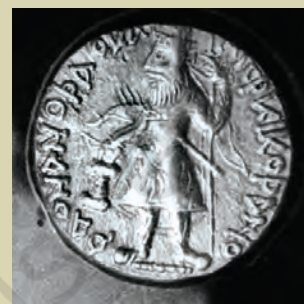
A Kushana coin

In the north, and in parts of central India, a general of the Mauryas, named Pushyamitra Shunga, set up a kingdom. The Shungas were followed by another dynasty, known as the Kanvas, and by rulers from other families till the establishment of the Gupta empire about 1700 years ago.