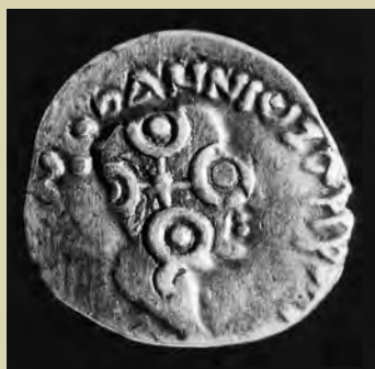
A Shaka coin

The Shakas who ruled over parts of western India fought several battles with the Satavahanas, who ruled over western and parts of central India. The Satavahana kingdom, which was established about 2100 years ago, lasted for about 400 years. Around 1700 years ago, a new ruling family, known as the Vakatakas, became powerful in central and western India.