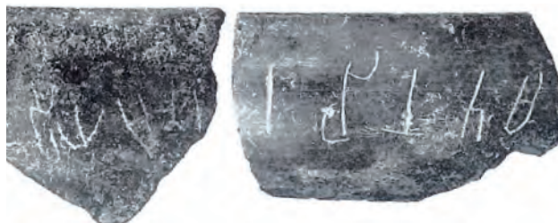
Tamil-Brahmi inscriptions. Several pieces of pottery have inscriptions in Brahmi, which was used to write Tamil.

was found at the site. Other finds include pottery from the Mediterranean region, such as amphorae (tall double-handled jars that contained liquids such as wine or oil) and stamped red-glazed pottery, known as Arretine Ware, which was named after a city in Italy. This was made by pressing wet clay into a stamped mould. There was yet another kind of pottery which was made locally, though Roman designs were used. Roman lamps, glassware and gems have also been found at the site.