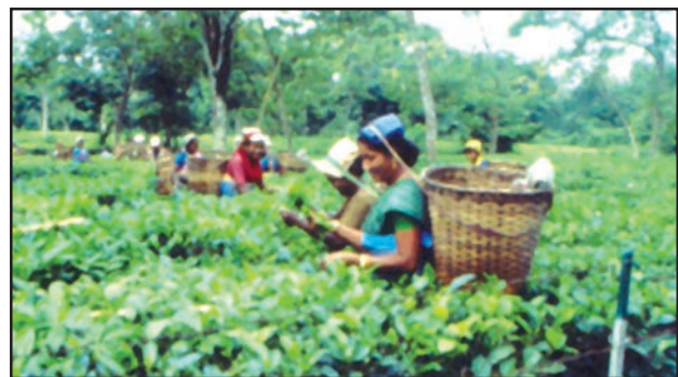
Fig. 6.10 : Tea Garden in Assam