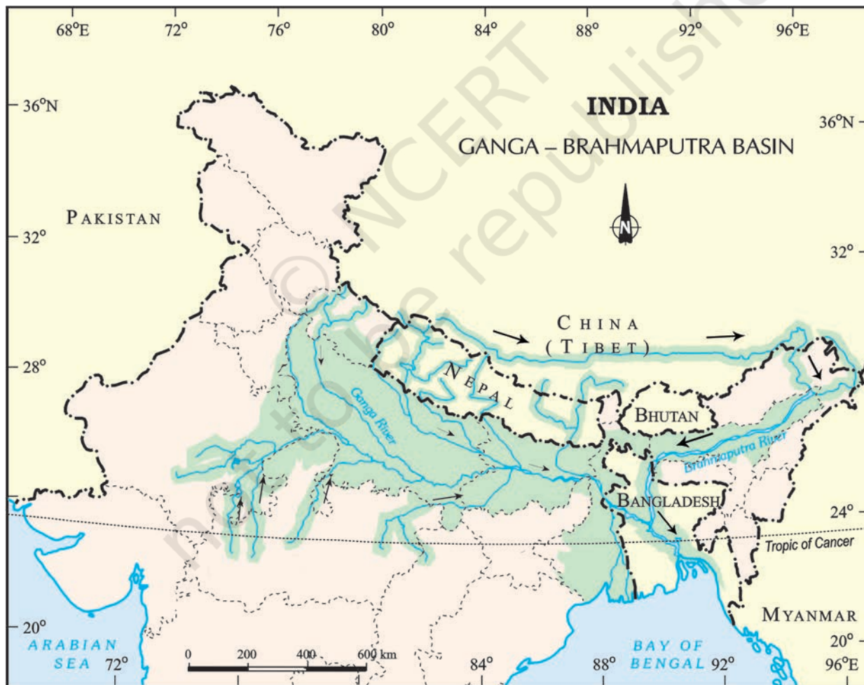
Fig. 6.8: Ganga-Brahmaputra Basin

The plains of the Ganga and the Brahmaputra, the mountains and the foothills of the