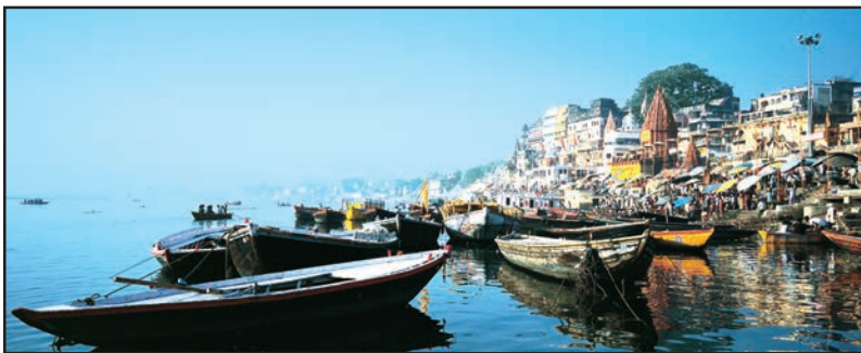
Fig. 6.13: Varanasi along the River Ganga

The Ganga-Brahmaputra plain has several big towns and cities. The cities of Allahabad, Kanpur, Varanasi, Lucknow, Patna and Kolkata all with the population of more than ten lakhs are located along the River Ganga (Fig. 6.13). The wastewater from these towns