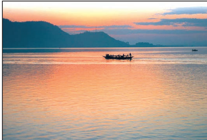
Fig. 6.7 Brahmaputra river

The tributaries of rivers Ganga and Brahmaputra together form the Ganga-Brahmaputra basin in the Indian subcontinent (Fig. 6.8). The basin lies in the sub-tropical region that is situated between 10°N to 30°N latitudes. The tributaries of the River Ganga like the Ghaghra, the Son, the Chambal, the Gandak, the Kosi and the tributaries of Brahmaputra drain it. Look at the atlas and find names of some tributaries of the River Brahmaputra.