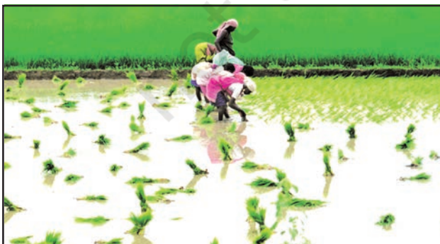
Fig. 6.9 : Paddy Cultivation

The vegetation cover of the area varies according to the type of landforms. In the Ganga and Brahmaputra plain tropical deciduous trees grow, along with teak, sal and peepal. Thick bamboo groves are common in the Brahmaputra plain. The delta area is covered with the