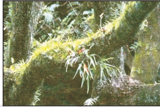
Fig. 6.3 : The Amazon Forest

As it rains heavily in this region, thick forests grow (Fig. 6.3). The forests are in fact so thick that the dense “roof” created by leaves and branches does not allow the sunlight to reach the ground. The ground remains dark and damp. Only shade tolerant vegetation may grow here. Orchids, bromeliads grow as plant parasites.