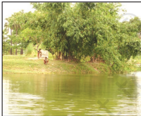
A clean lake

Binod is a fisherman living in the Matwali Maun village of Bihar. He is a happy man today. With the efforts of the fellow fishermen – Ravindar, Kishore, Rajiv and others, he cleaned the maun or the ox-bow lake to cultivate different varieties of fish. The local weed (vallineria, hydrilla) that grows in the lake is the food of the fish. The land around the lake is fertile. He sows crops such as paddy, maize and pulses in these fields. The buffalo is used to plough the land. The community is satisfied. There is enough fish catch from the river – enough fish to eat and enough fish