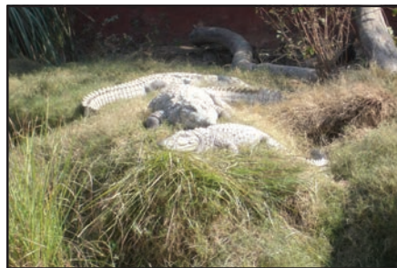
Fig. 6.12 : Crocodiles