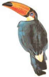
Fig. 6.4 : Toucans

The rainforest is rich in fauna. Birds such as toucans (Fig. 6.4), humming birds, macaw with their brilliantly coloured plumage, oversized bills for eating make them different from birds we commonly see in India. These birds also make loud sounds in the forests. Animals like monkeys, sloth and ant-eating tapirs are found here (Fig. 6.5). Various species of reptiles and snakes also thrive in these jungles. Crocodiles, snakes, pythons abound. Anaconda and boa constrictor are some of the species. Besides, the basin is home to thousands of species of insects. Several species of fishes including the flesh-eating Piranha fish is also found in the river. This basin is thus extraordinarily rich in the variety of life found there.