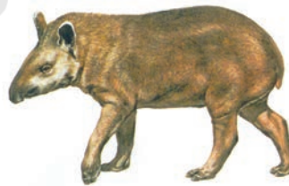
Fig. 6.5 : Tapir

The rainforest is rich in fauna. Birds such as toucans (Fig. 6.4), humming birds, macaw with their brilliantly coloured plumage, oversized bills for eating make them different from birds we commonly see in India. These birds also make loud sounds in the forests. Animals like monkeys, sloth and ant-eating tapirs are found here (Fig. 6.5). Various species of reptiles and snakes also thrive in these jungles. Crocodiles, snakes, pythons abound. Anaconda and boa constrictor are some of the species. Besides, the basin is home to thousands of species of insects. Several species of fishes including the flesh-eating Piranha fish is also found in the river. This basin is thus extraordinarily rich in the variety of life found there.