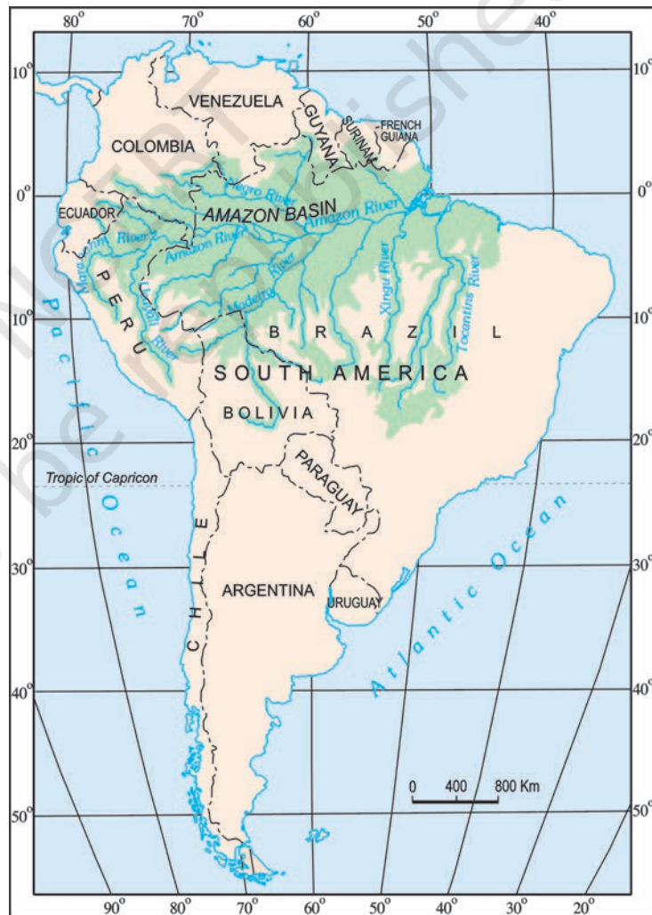
Fig. 6.2: The Amazon Basin in South America

Name the countries of the basin through which the equator passes.