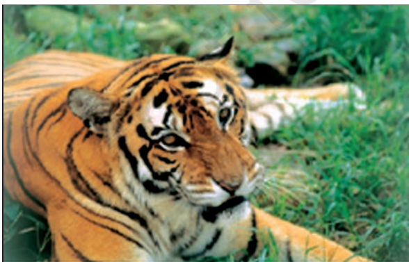
Fig. 6.14: Tiger in Manas Wildlife sanctuary

All the four ways of transport are well developed in the Ganga-Brahmaputra basin. In the plain areas the roadways and railways transport the people from one place to another. The waterways, is an effective means of transport particularly along the rivers. Kolkata is an important port on the River Hooghly. The plain area also has a large number of airports.