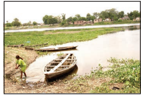
A Polluted Lake

to sell in the market. They have even begun supply to the neighbouring town. The community is living in harmony with nature. As long as the pollutants from nearby towns do not find their way into the lake waters, the fish cultivation will not face any threat.