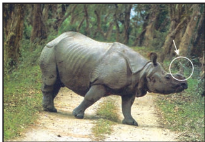
Fig. 6.11 : One horned rhinoceros

There is a variety of wildlife in the basin. Elephants, tigers, deer and monkeys are common. The one-horned rhinoceros is found in the Brahmaputra plain. In the delta area, Bengal tiger and crocodiles are found. Aquatic life abounds in the fresh river waters, the lakes and the Bay of Bengal Sea. The most popular varieties of the fish are the rohu, catla and hilsa. Fish and rice is the staple diet of the people living in the area.