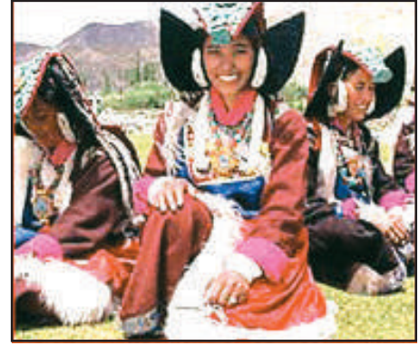
Fig. 7.6: Ladakhi Women in Traditional Dress

Life of people is undergoing change due to modernisation. But the people of Ladakh have over the centuries learned to live in balance and harmony with nature. Due to scarcity of resources like water and fuel, they are used with reverence and care. Nothing is discarded or wasted.