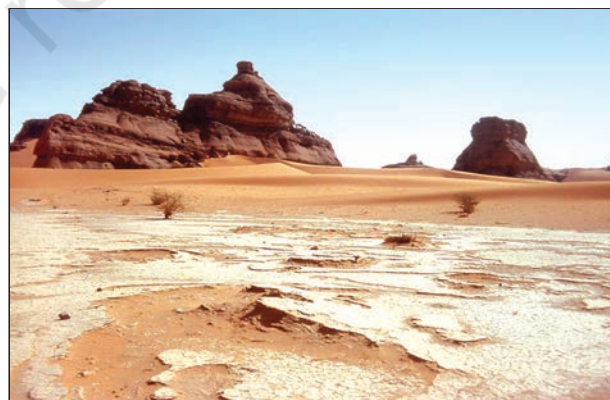
Fig. 7.1: The Sahara Desert

When you think of a desert the picture that immediately comes to your mind is that of sand. But besides the vast stretches of sands, that Sahara desert is covered with, there are also gravel plains and elevated plateaus with bare rocky surface. These rocky surfaces may be more than 2500m high at some places.