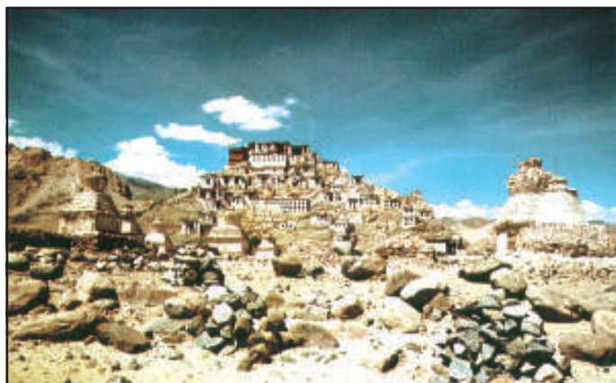
Fig. 7.5: Thiksey Monastery

The finest cricket bats are made from the wood of the willow trees.