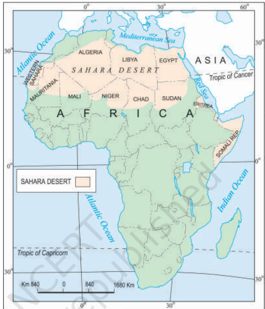
Fig. 7.2: Sahara in Africa

You will be surprised to know that present day Sahara once used to be a lush green plain. Cave paintings in Sahara desert show that there used to be rivers with crocodiles. Elephants, lions, giraffes, ostriches, sheep, cattle and goats were common animals. But the change in climate has changed it to a very hot and dry region.