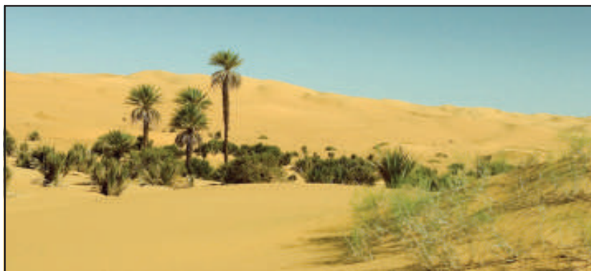
Fig. 7.3: Oasis in the Sahara Desert

snakes and lizards are the prominent animal species living there.