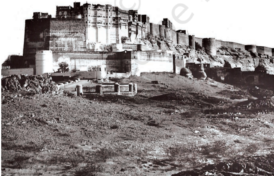
Fig. 5 Mehrangarh Fort, Jodhpur

Raja Jai Singh was at the height of his power. He was the governor of Agra for 12 years and of Malwa for 5 or 6 years. He possessed a large army, artillery and great wealth. His sway extended from Delhi to the banks of the Narmada.