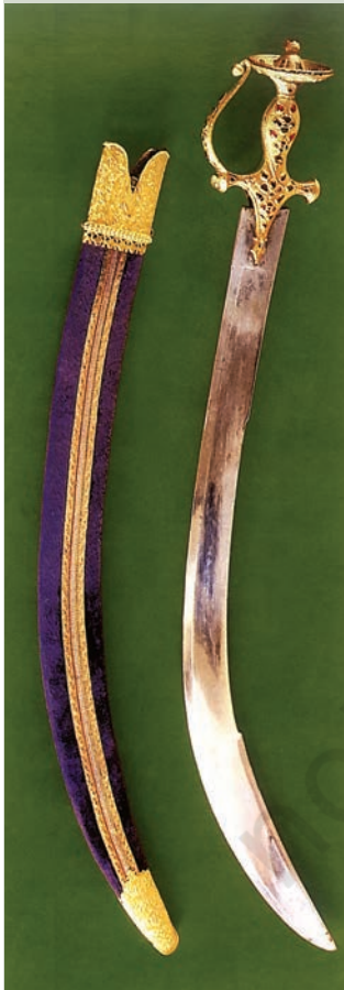
Fig. 6 Sword of Maharaja Ranjit Singh.

The organisation of the Sikhs into a political community during the seventeenth century (see Chapter 6) helped in regional state-building in the Punjab. Several battles were fought by Guru Gobind Singh against the Rajput and Mughal rulers, both before and after the institution of the Khalsa in 1699. After his death in 1708, the Khalsa rose in revolt against the Mughal authority under Banda Bahadur's leadership, declared their sovereign rule by striking coins in the name of Guru Nanak and Guru Gobind Singh, and established their own administration between the Sutlej and the Jamuna. Banda Bahadur was captured in 1715 and executed in 1716.