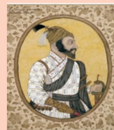
Fig. 7 Portrait of Shivaji

The Maratha kingdom was another powerful regional kingdom to arise out of a sustained opposition to Mughal rule. Shivaji (1627–1680) carved out a stable kingdom with the support of powerful warrior families ( deshmukhs ). Groups of highly mobile, peasant-pastoralists ( kunbis ) provided the backbone of the Maratha army. Shivaji used these forces to challenge the Mughals in the peninsula. After Shivaji’s death, effective power in the Maratha state was wielded by a family of Chitpavan Brahmanas who served Shivaji’s successors as Peshwa (or principal minister). Poona became the capital of the Maratha kingdom.