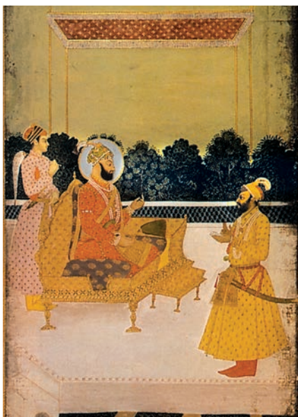
Fig. 2 Farrukh Siyar receiving a noble in court.

Many Rajput rulers had accepted the suzerainty of the Mughals but Mewar was the only Rajput state which defied Mughal authority. Rana Pratap ascended the throne at Mewar in 1572, with Udaipur and large part of Mewar under his control. A series of envoys were sent to the Rana to persuade him to accept Mughal suzerainty, but he stood his ground.