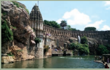
Fig. 3 Chittorgarh Fort, Rajasthan

Many Rajput chieftains built a number of forts on hill tops which became the centres of power. With extensive fortifications, these majestic structures housed urban centres, palaces, temples, trading centres, water harvesting structures and other buildings. The Chittorgarh fort contained many water bodies varying from talabs (ponds) to kundis (wells), baolis (stepwells), etc.