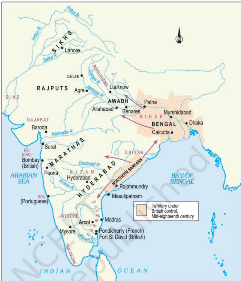
Map 2 British territories in the mid-eighteenth century.

In this chapter, we will read about the emergence of new political groups in the subcontinent during the first half of the eighteenth century – roughly from 1707, when Aurangzeb died, till the third battle of Panipat in 1761.