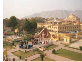
Fig. 4 Jantar Mantar in Jaipur