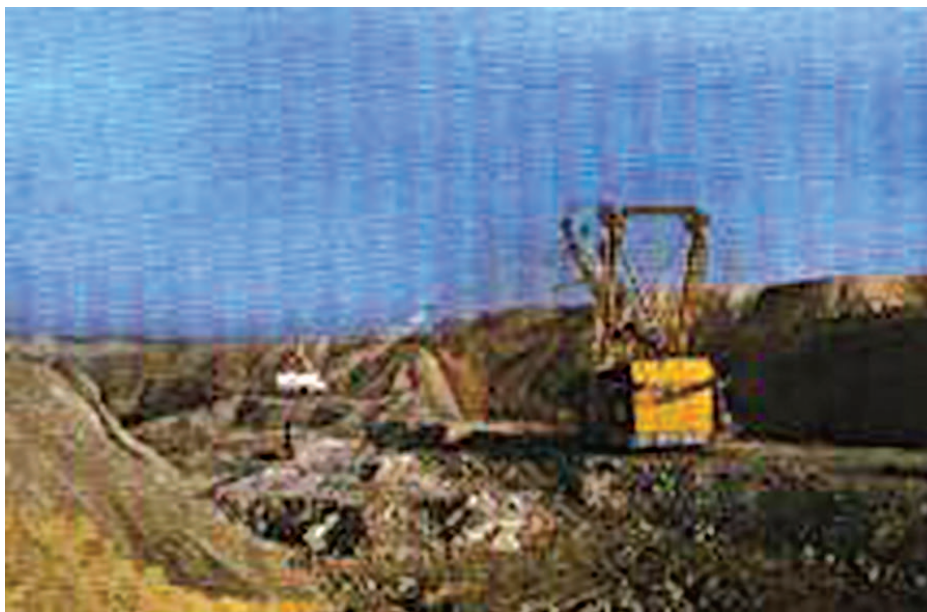
Fig. 3.2: A coal mine

When heated in air, coal burns and produces mainly carbon dioxide gas.