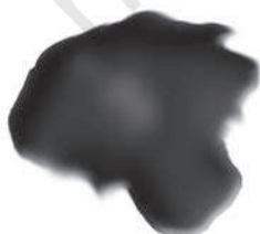
Fig. 3.3: Coal tar

It is a black, thick liquid (Fig. 3.3) with an unpleasant smell. It is a mixture of