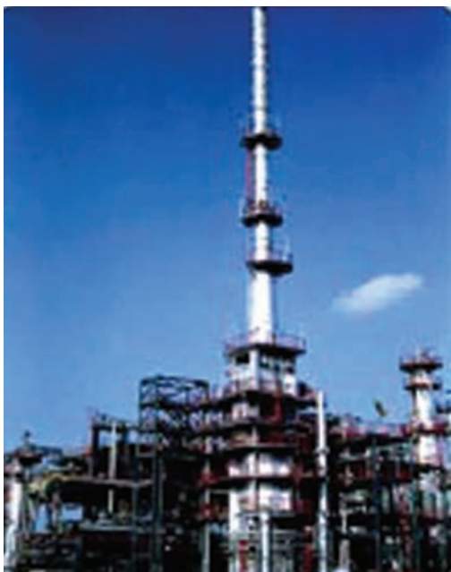
Fig. 3.5: A petroleum refinery

separating the various constituents/ fractions of petroleum is known as refining. It is carried out in a petroleum refinery (Fig. 3.5).