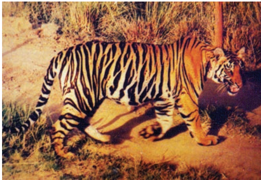
Fig. 5.4 : Tiger

Tiger (Fig. 5.4) is one of the many species which are slowly disappearing from our forests. But, the Satpura Tiger Reserve is unique in the sense that a significant increase in the population of tigers has been seen here. Once upon a time, animals like lions, elephants, wild