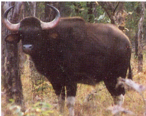
Fig. 5.5 : Wild buffalo

buffaloes (Fig. 5.5) and barasingha (Fig. 5.6) were also found in the Satpura National Park. Animals whose numbers are diminishing to a level that they might face extinction are known as the endangered animals . Boojho is reminded of the dinosaurs which became extinct a long time ago. Survival of some