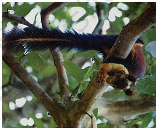
Fig. 5.3 (b) : Giant squirrel

endemic flora of the Pachmarhi Biosphere Reserve. Bison, Indian giant squirrel [Fig. 5.3 (b)] and flying squirrel are endemic fauna of this area. Professor Ahmad explains that the destruction of their habitat, increasing population and introduction of new species may affect the natural habitat of endemic species and endanger their existence.