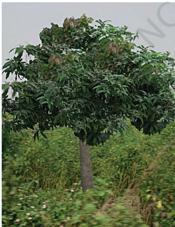
Fig. 5.3 (a) : Wild Mango

Madhavji shows sal and wild mango (Fig. 5.3 (a)) as two examples of the