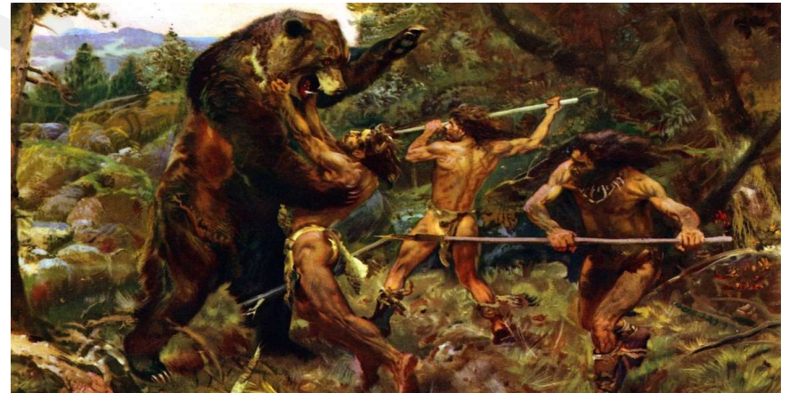
Hunter - gatherers