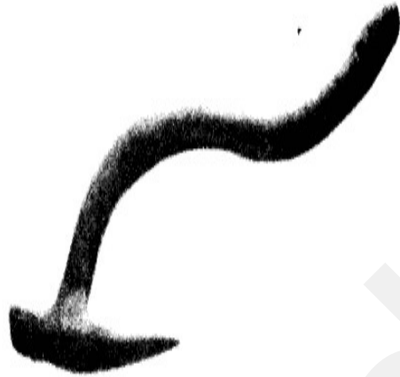
A Toy Plough

Children would have preferred toy carts instead of ploughs.