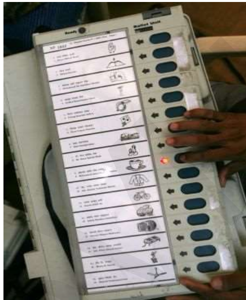
Present day elections