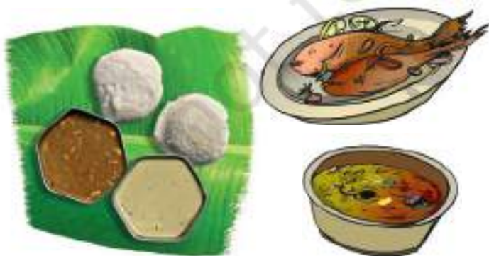
Fig. 1.1 Different food items

There seems to be so much variety in the food that we eat (Fig 1.1). What are these food items made of?