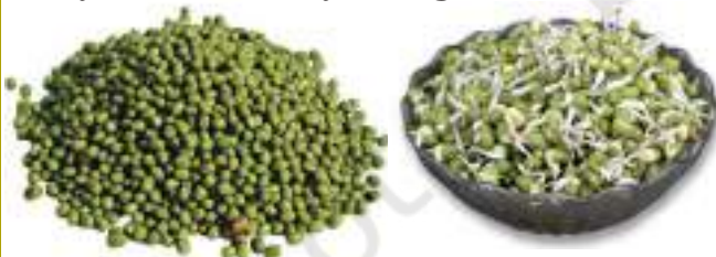
Fig. 1.5 Whole moong and its sprouts

Take some dry seeds of moong or chana . Put a small quantity of seeds in a container filled with water and leave this aside for a day. Next day, drain the water completely and leave the seeds in the vessel. Wrap them with a piece of wet cloth and set aside. The following day, do you observe any changes in the seeds?