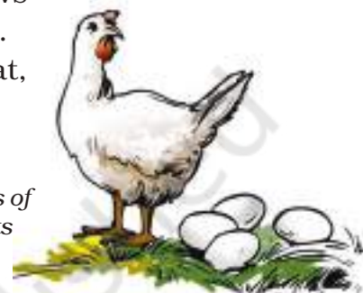
(b) Animal sources