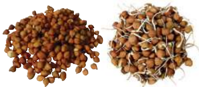
Fig. 1.6 Chana ( gram ) and its sprouts

A small white structure may have grown out of the seeds. If so, the seeds have sprouted (Fig. 1.5 and 1.6). If not, wash the seeds in water, drain the water and leave them aside for another day,