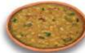
(a) Plant sources