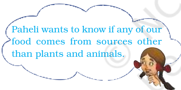
Table 1.4 Plant parts as food

Some plants have two or more edible (eatable) parts. Seeds of mustard plants give us oil and the leaves are used as a vegetable. Can you think of the different parts of a banana plant that are used as food? Think of more examples where two or more parts of a single plant are used as food.