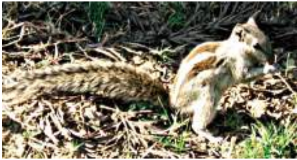
Fig. 1.8 Squirrel eating nuts

You will then surely be aware of the food, the animal eats. What about other animals? Have you ever observed what a squirrel (Fig 1.8), pigeon, lizard or a small insect may be eating as their food?