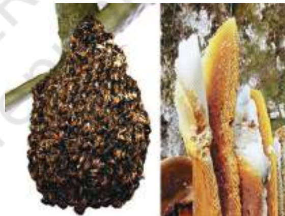
Fig. 1.7 Beehive

Do you know where honey comes from, or how it is produced? Have you seen a beehive where so many bees keep buzzing about? Bees collect nectar (sweet juices) from flowers, convert it