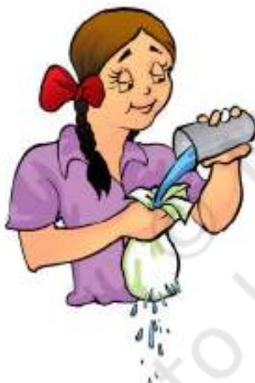
Fig. 4.2 Using a cloth tumbler

Have you ever wondered why a tumbler is not made with a piece of cloth? Recall our experiments with pieces of cloth in Chapter 3 and also keep in mind that we generally use a tumbler to keep a liquid. Therefore, would it not be silly, if we were to make a tumbler out of cloth (Fig 4.2)! What we need for a tumbler is glass, plastics, metal or other such material that will hold water. Similarly, it would not be wise to use paper-like materials for cooking vessels.