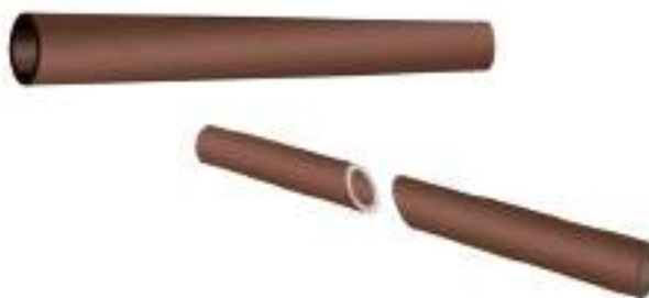
Fig. 4.3 Cutting pieces of materials to see if they have lustre

Do you notice such a shine or lustre in the other materials, cut them anyway as you can? Repeat this in the class with as many materials as possible and make a list of those with and without lustre. Instead of cutting, you can rub the surface of material with sand paper to see if it has lustre.