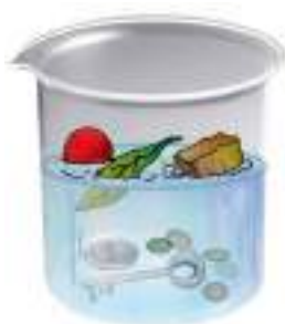
Figure 4.6 Some objects float in water while others sink in it

drops of honey that you let fall into a glass of water. What happens to all of these?