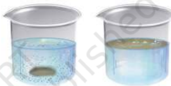
Fig. 4.4 What disappears, what doesn't?

beakers. Fill each one of them about two-thirds with water. Add a small amount (spoonful) of sugar to the first glass, salt to the second and similarly, add small amounts of the other substances into the other glasses. Stir the contents of each of them with a spoon. Wait for a few minutes. Observe what happens to the substances added to water (Fig. 4.4). Note your observations as shown in Table 4.3.