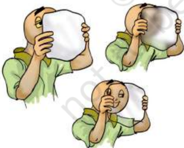
Fig. 4.7 Looking through opaque, transparent or translucent material

You might have played the game of hide and seek. Think of some places where you would like to hide so that you are not seen by others. Why did you choose those places? Would you have tried to