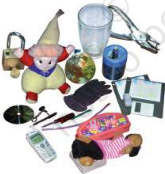
Fig. 4.1 Objects around us

Let us collect as many objects as possible, from around us. Each of us could get some everyday objects from home and we could also collect some objects from the classroom or from outside the school. What will we have in our collection? Chalk, pencil, notebook, rubber, duster, a hammer, nail, soap, spoke of a wheel, bat,