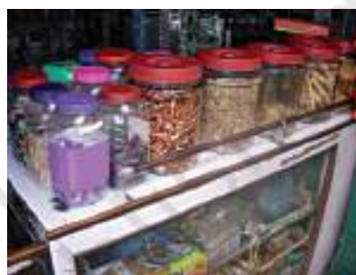
Fig. 4.8 Transparent bottles in a shop

hide behind a glass window? Obviously not, as your friends can see through that and spot you. Can you see through all the materials? Those substances or materials, through which things can be seen, are called transparent (Fig. 4.7). Glass, water, air and some plastics are examples of transparent materials. Shopkeepers usually prefer to keep biscuits, sweets and other eatables in transparent containers of glass or