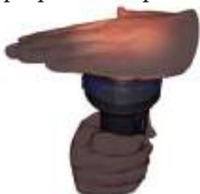
Fig. 4.9 Does torch light pass through your palm?

We can therefore group materials as opaque, transparent and translucent.