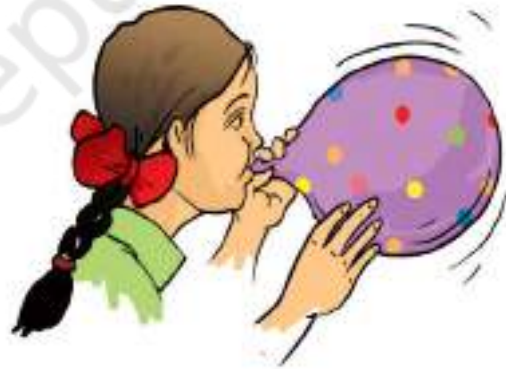
Fig 6.1 A balloon changes its size and shape on blowing air into it

Take a balloon and blow it. Take care that it does not burst. The shape and size of the balloon have changed (Fig. 6.1). Now, let the air escape the balloon.