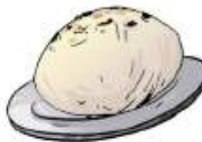
Fig 6.5 A roti

Roll out a roti from the ball of dough again and bake it on a tawa (Fig.6.5).