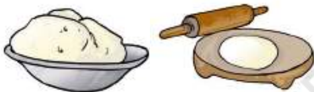
Fig 6.3 A ball of dough and a rolled out roti

Take some dough and make a ball. Try to roll out a roti (Fig. 6.3). May be you are not happy with its shape and wish to change it back into a ball of dough again.