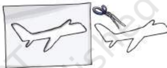
Fig. 6.4 An aeroplane cut out of paper

Take the same piece of paper, which you used in Activity 2. Draw an aeroplane on it and cut along its outline (Fig.6.4).