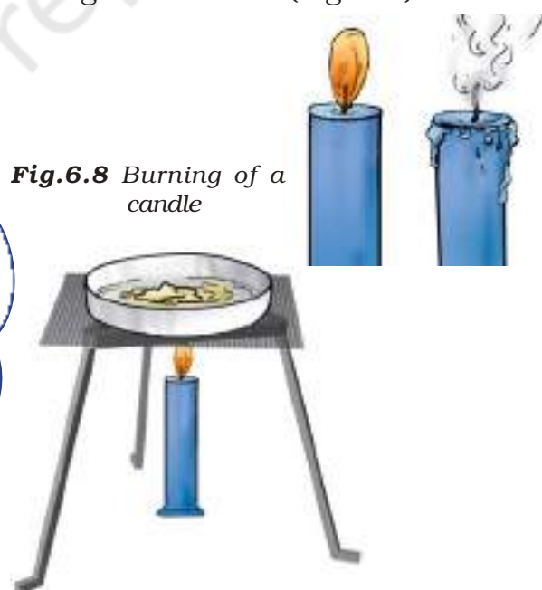
Fig.6.8 Burning of a candle

Can the change in the length of the candle be reversed? If we were to take some wax in a pan and heat it, can this change be reversed (Fig. 6.9)?