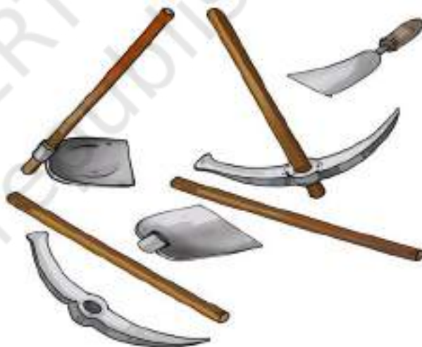
Fig. 6.6 Tools are often heated before fixing wooden handles

The iron blade of these tools has a ring in which the wooden handle is fixed. Normally, the ring is slightly smaller in size than the wooden handle. To fix the handle, the ring is heated and it becomes slightly larger in size ( expands ). Now, the handle easily fits into the ring. When the ring cools down it contracts and fits tightly on to the handle.