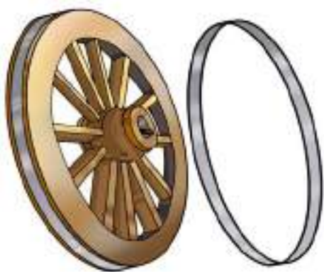
Fig. 6.7 Cart wheel with metal rim fixed to it

When we heat water in a pan, it begins to boil after some time. If we continue to heat further, the quantity of water in the pan begins to decrease.