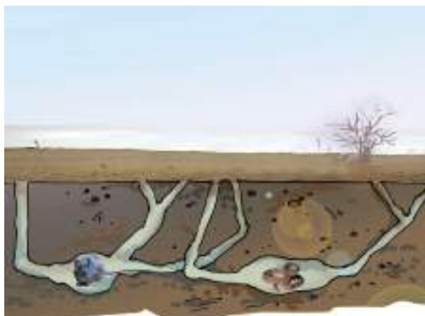
Fig. 9.4 Desert animals in burrows

Bring a potted cactus and a leafy plant to the classroom. Tie polythene bags to some parts of the two plants, as was done for Activity 4 in Chapter 7, where we studied transpiration in plants.