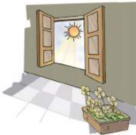
Fig. 9.12 Plant respond to light

it is not growing upright. Do you think, this may be in response to some stimulus?