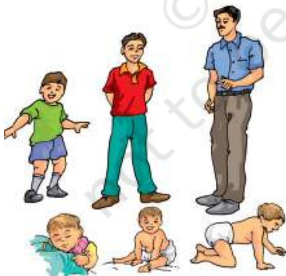
Fig. 9.10 A baby grows into an adult

Young ones of animals also grow into adults. You would surely have