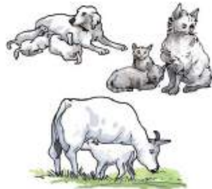
Fig. 9.14 Some animals which give birth to their young ones

Plants also reproduce. Like animals, plants also differ in their mode of reproduction. Many plants reproduce through seeds. Plants produce seeds,