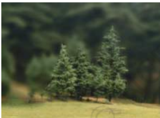
Fig. 9.6 Trees of a mountain habitat

There is a large variety of plants and animals living in the mountain regions. Have you seen the kind of trees shown in Fig. 9.6?