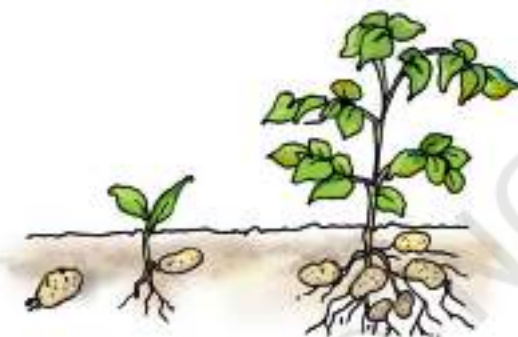
Fig. 9.16 A new plant grows from a bud of potato

Some plants also reproduce through parts other than seeds. For example, a part of a potato with a bud, grows into a new plant (Fig 9.16).