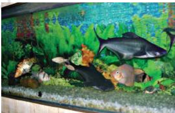
Fig. 9.3 Different kinds of fish