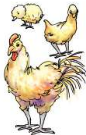
Fig. 9.11 A chicken grows into an adult

The process of breathing in animals like cows, buffaloes, dogs or cats is similar to humans. Observe any one of these animals while they are taking rest, and notice the movement of their abdomen. This slow movement indicates that they are breathing.