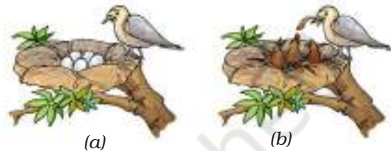
Fig. 9.13 (a) Birds lay eggs which after hatching produce (b) young ones

Have you ever seen nests of some birds like pigeons? Many birds lay their eggs in the nest. Some of the eggs hatch and young birds come out of them (Fig. 9.13).