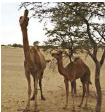
Fig. 9.2 Camels in their surroundings

The plants and animals that live on land are said to live in terrestrial habitats . Some examples of terrestrial habitats are forests, grasslands, deserts, coastal and mountain regions. On the other hand, the habitats of plants and