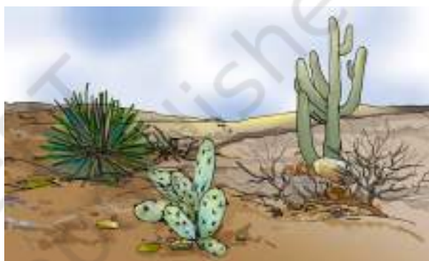
Fig. 9.5 Some typical plants that grow in desert

Leave the potted plants in the sun and observe after a few hours. What do you see? Do you notice any difference in the amount of water collected in the two polythene bags?