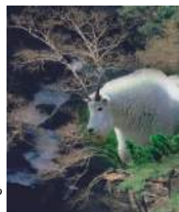
Fig. 9.7 (a) Snow leopard, (b) yak and (c) mountain goat are adapted to mountain habitats