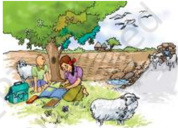
Fig. 9.1 Search for living organisms

of some kind or the other (Fig. 9.1). Paheli started thinking and reading about far away places. She read that people have even found tiny living organisms in the openings of volcanoes!