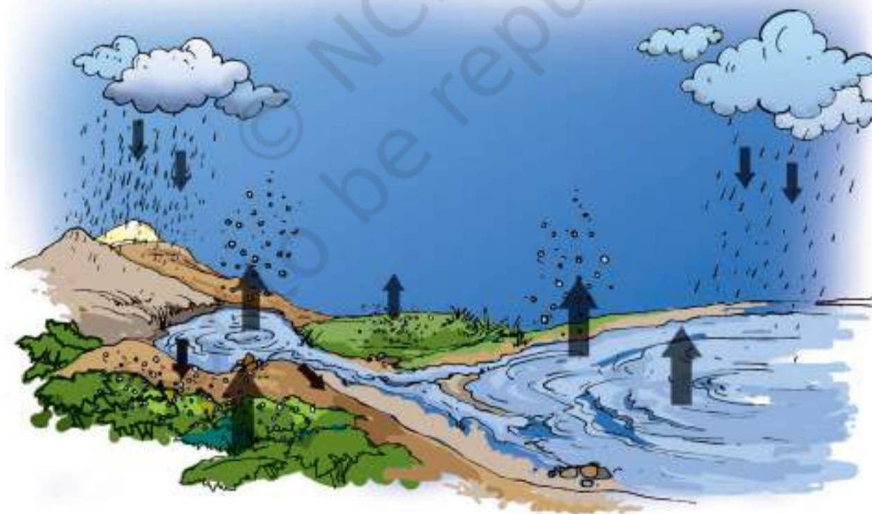
Fig. 14.9 Water cycle

However, excess of rainfall may lead to many problems (Fig. 14.10). Heavy