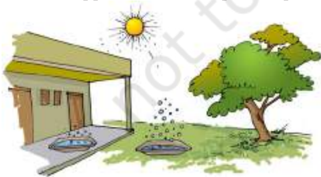
Fig.14.5 Evaporation of water in sunlight and in shade

In Activity 2, did you find that water also disappeared from the plate kept in