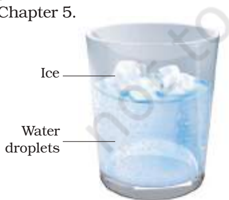
Fig. 14.6 Drops of water appear on outer surface of the glass containing water with ice

From where do water drops appear on the outer side of the glass? The cold surface of the glass containing iced water, cools the air around it, and the water vapour of the air condenses on the surface of the glass. We noticed this process of condensation in Activity 7 in Chapter 5.