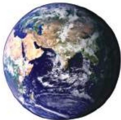
Fig. 14.3 Oceans cover a major part of the earth

Do you know that about two thirds of the Earth is covered with water? Most of this water is in oceans and seas (Fig. 14.3).