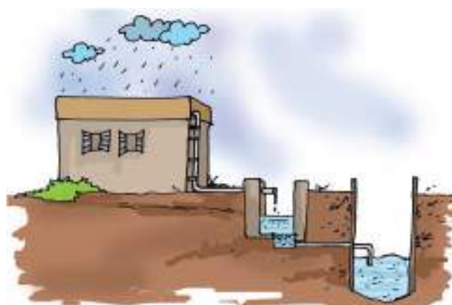
Fig. 14.13 Rooftop rainwater harvesting

1. Rooftop rainwater harvesting : In this system the rainwater is collected from