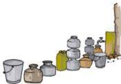
Fig. 14.12 A queue for collecting water

The demand for water is increasing day-by-day. The number of people using water is increasing with rising population. In many cities, long queues for collection of water are a common site (Fig. 14.12). Also, more and more water is being used for producing food and by the industries. These factors are leading