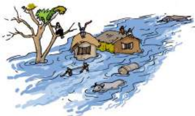
Fig. 14.11 A scene of a flooded area

rains may lead to rise in the level of water in rivers, lakes and ponds. The water may then spread over large areas causing floods. The crop fields, forests, villages, and cities may get submerged by water (Fig. 14.11). In our country, floods cause extensive damage to crops, domestic animals, property and human life.