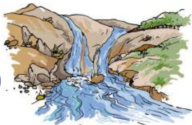
Fig. 14.8 Rainwater flows down in the form of streams and rivers

Snow in the mountains melts into water. This water flows down the mountains in the form of streams and rivers (Fig. 14.8). Some of the water that falls on land as rain, also flows in the form of rivers and streams. Most of the rivers cover long distances on land and ultimately fall into a sea or an ocean. However, water of some rivers flows into lakes.