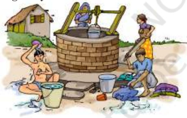
Fig. 14.1 Uses of water

Apart from drinking, there are so many activities for which we use water (Fig. 14.1). Do you have an idea about the quantity of water we use in a single day?