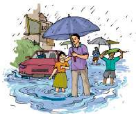
Fig. 14.10 A scene after heavy rains

The time, duration and the amount of rainfall varies from place to place. In some parts of the world it rains throughout the year while there are places where it rains only for a few days.