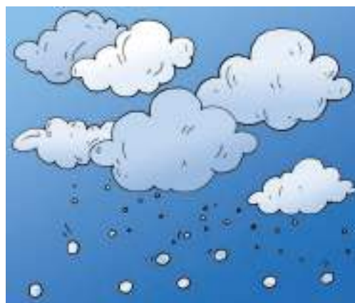
Fig. 14.7 Clouds

It so happens that many droplets of water come together to form larger sized