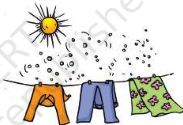
Fig. 14.4 Clothes drying on a clothes-line

How many times have you noticed that water spilled on a floor dries up after some time? The water seems to disappear. Similarly, water disappears from wet clothes as they dry up (Fig. 14.4). Water from wet roads, rooftops and a few other places also disappears after the rains. Where does this water go?